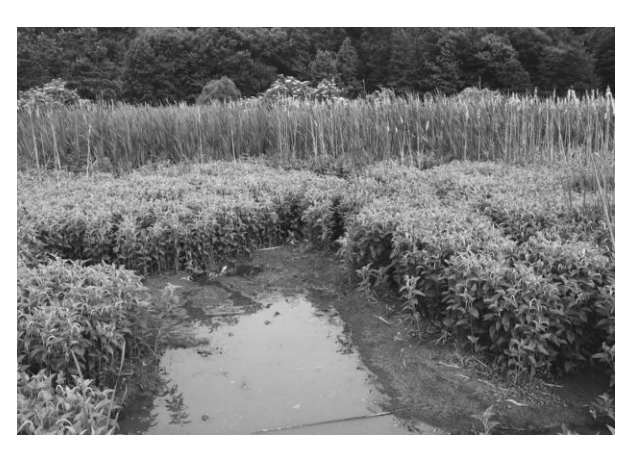
Fig. 1. Stands of lizard's-tail (foreground) and cattail frequented by a Black Rail in Huntley Meadows County Park, Fairfax County, Virginia, from 10 June to 13 July 2002.

I mapped the rail's territory on seven days, 22 June to 4 July, by tracking its vocalizations from the elevated boardwalk that winds across the floodplain of Barnyard Run with a global positioning system (GPS) receiver. The rail frequented a roughly circular area of marsh (ca.