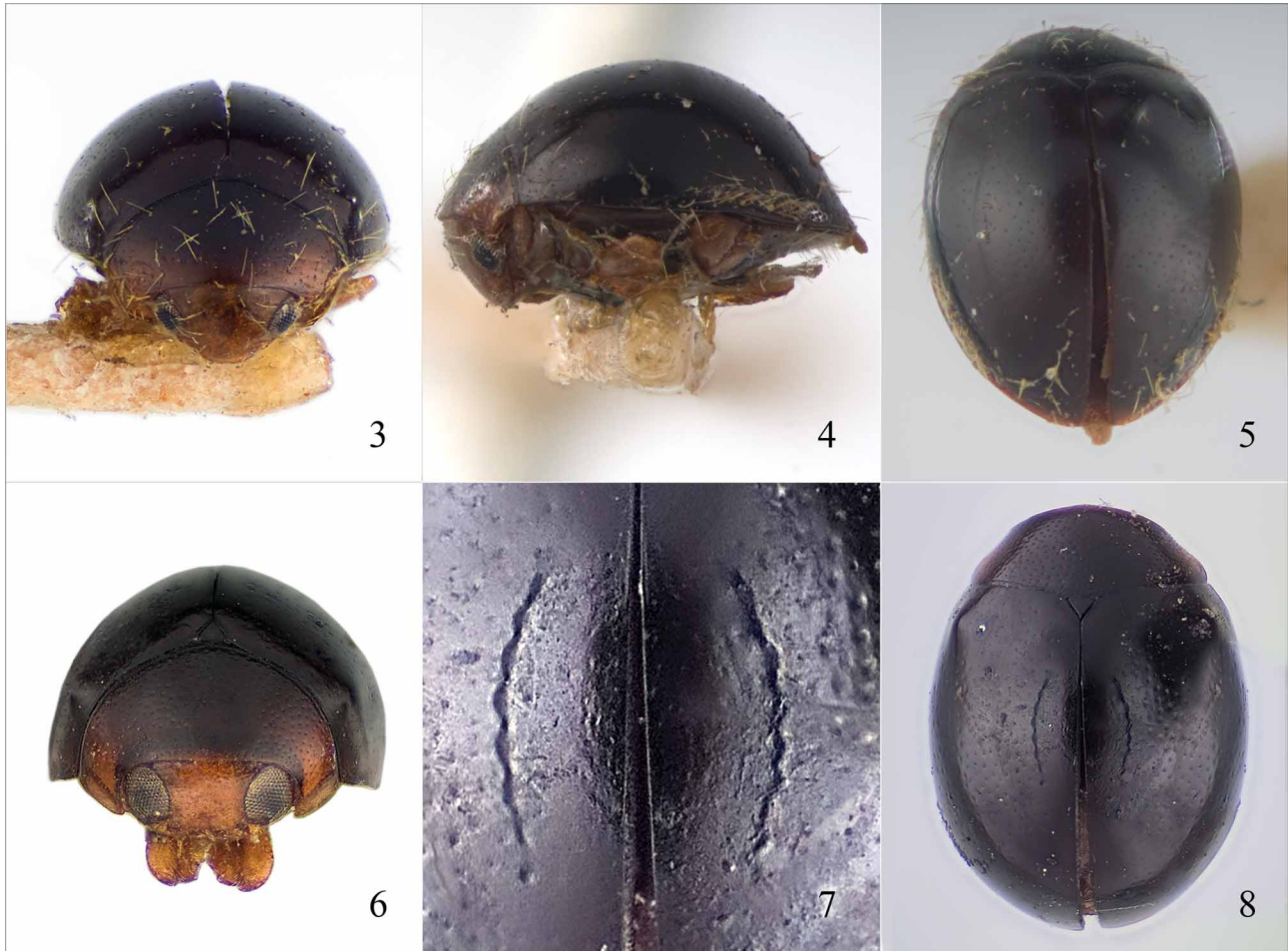
FIGURES 3–8. Digital images of A. hirtula type series. 3–5, Lectotype, male, whole body. 3, Frontal view (many setae abraded). 4, Left lateral view (note submarginal patch of decumbent setae in apical half). 5, Dorsal view (many setae abraded). 6–8, Paralectotype #2 (= Microscymmus , undescribed species). 6, Frontal view. 7, Dorsal view, detail showing impressed parasutural striae forming parentetical grooves. 8, Dorsal view of whole body.

beginning just above epipleural fovea for reception of metafemoral apex, continued posteriorly to area above hind margin of 4 th abdominal ventrite (Fig. 4); lateral margin of elytron slightly undulate, with weakly raised lateral bead; epipleuron with depression for reception of mid-, hind femora. Prosternum convex with anterior margin arcuate, with few very fine scattered punctures. Meso-, metasternum obscured by glue and paper point. Abdomen with intercoxal process of ventrite I with few fine scattered punctures; ventrites II–IV finely rugostriate; ventrite V with narrow rugostriate band near base, remainder polished with moderately coarse scattered setiferous punctures separated by 3–5 times their diameter; each seta about ¼ to 1/3 length of segment along midline. Meso-, metatibiae with median cusplike angulation on outer margin of ventral face.