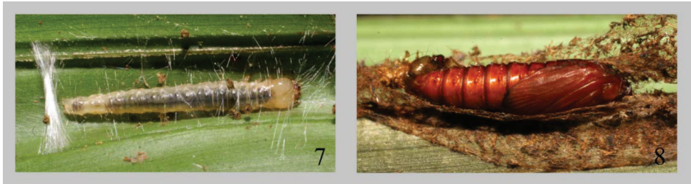
Figures 7–8. Early stages of Sparganocosma docturnerorum . 7 Penultimate instar larva 8 Pupa.