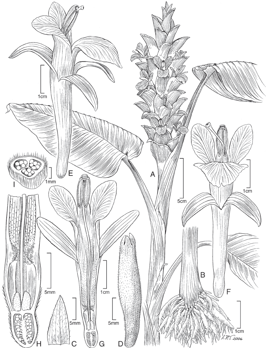
Figure 2. Curcuma arracanensis W.J.Kress & V.Gowda. A Habit of flowering plant B Tuberos rhizome C Ligule D Bracteole E Flower, lateral view F Flower, frontal view G Flower, cut-away view showing style and anthers H Base of flower, cut-away view showing style, epigynous nectaries and placentation I Placentation, cross section. WJK 03-7328 (US).

living collection cultivated at the Smithsonian Botany Research Greenhouses as US-BRG 1997–141, 29 September 2011, W. J. Kress, V. Gowda & M. Bordelon 11–8809 (holotype: US! [US 3635561, barcode 00940954; isotypes RAF!, E!).