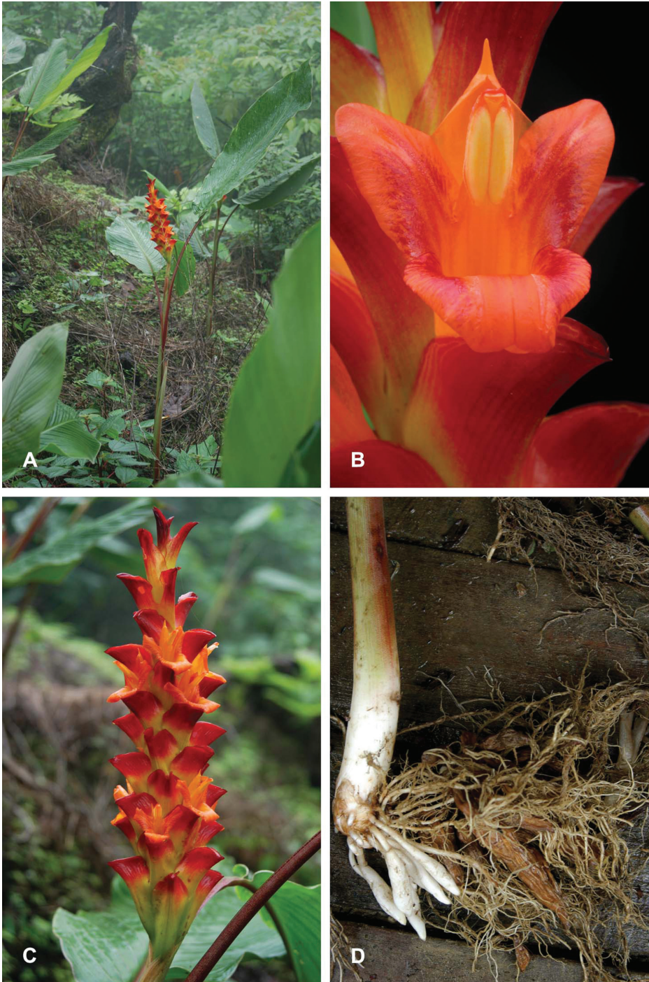
Plate 2. Curcuma arracanensis W.J.Kress & V.Gowda. A Habit B Flower, frontal view C Inflorescence D Rhizome. WJK 03-7328 (US).