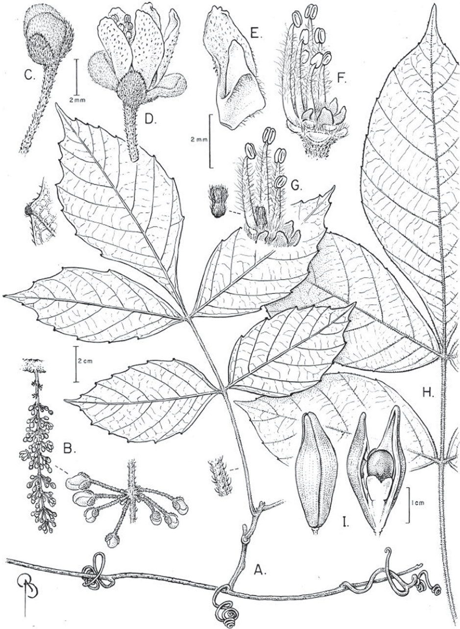
Figure 4. Paullinia prevostiana A Branch with leaf and tendrils, detail of marginal tooth, and detail of petiole pubescence B Inflorescence and detail of cincinnus C Flower bud D Staminate flower, lateral view E Lateral petal with appendage F Staminate flower with perianth removed to show nectary glands and stamens G Staminate flower with perianth and few stamens removed to show nectary glands and pistillode, detail of pistillode H Larger leaf I Capsule, un-dehiscent and dehiscent showing seed, basal sarcotesta, and funiculus. A-G from Prevost 3741 (US); H-I from Mori et al. 25555 (NY).