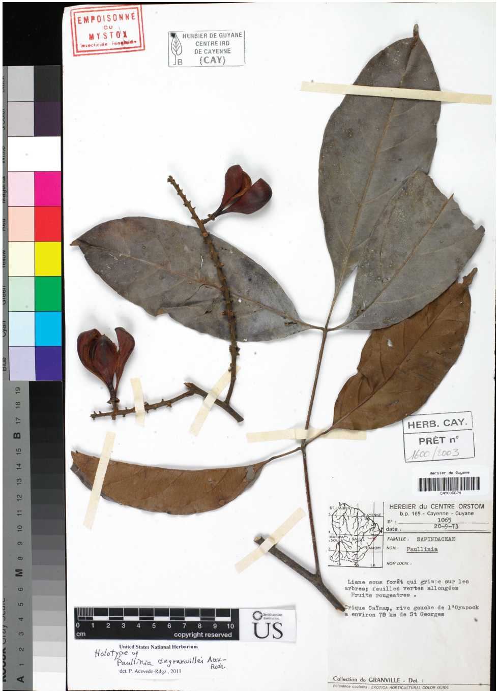
Figure 2. Paullinia degranvillei . Photo of the holotype.