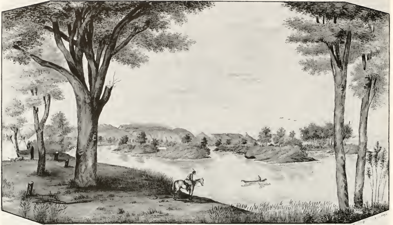
The Yellowstone River near Ft Keogh, Montana