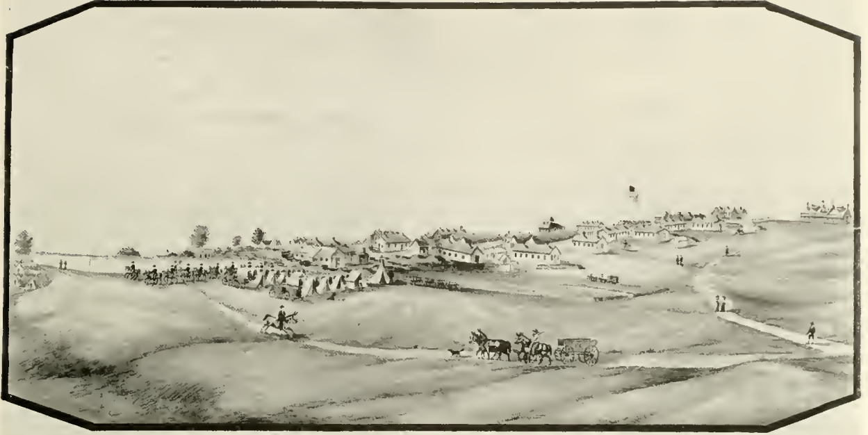
Figure 6.— Fort Harker, Kansas; east side. ( USNM 384187;)