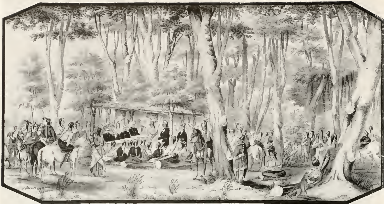
Figure 3. —Satanta addressing the peace commissioners at Council Grove, Medicine Lodge Creek, Kansas. (U.S.V.M. 384183; Smithsonian photo 38298.)

with some distinction as Brotherton was breveted major for gallantry as a result of his unit's performance. 13 Unfortunately for posterity, Stieffel did not record his impressions of this little-known sideshow of the Civil War.