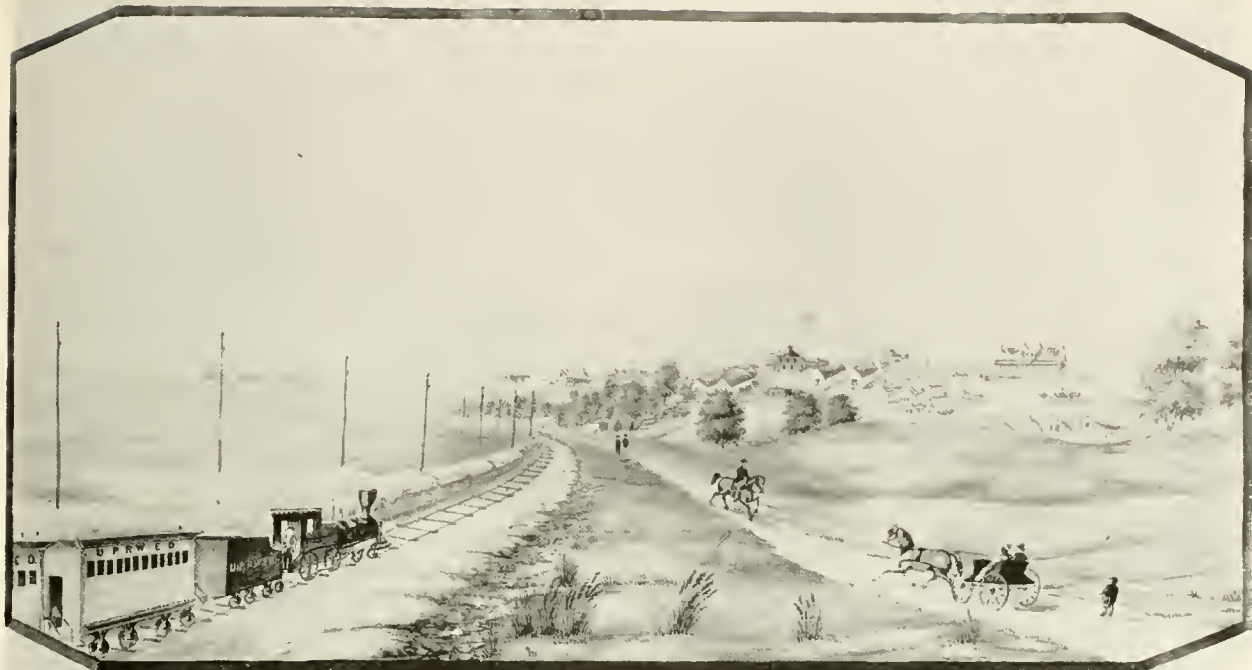
Figure 7.—Fort Harker, Kansas; south side. (USNM 384186; Smithsonian photo 38986.)

defended by only 25 men, at least a part of whom were Mexicans described by Marcy as badly frightened. 28 The soldier in the center background making a dash for the corralled wagons is probably a flanker cut off by the sudden attack, possibly the Lt. Williams who was wounded, since only officers in the infantry were mounted. The group of Indians around the fire (in the right centerground) cannot be accounted for.