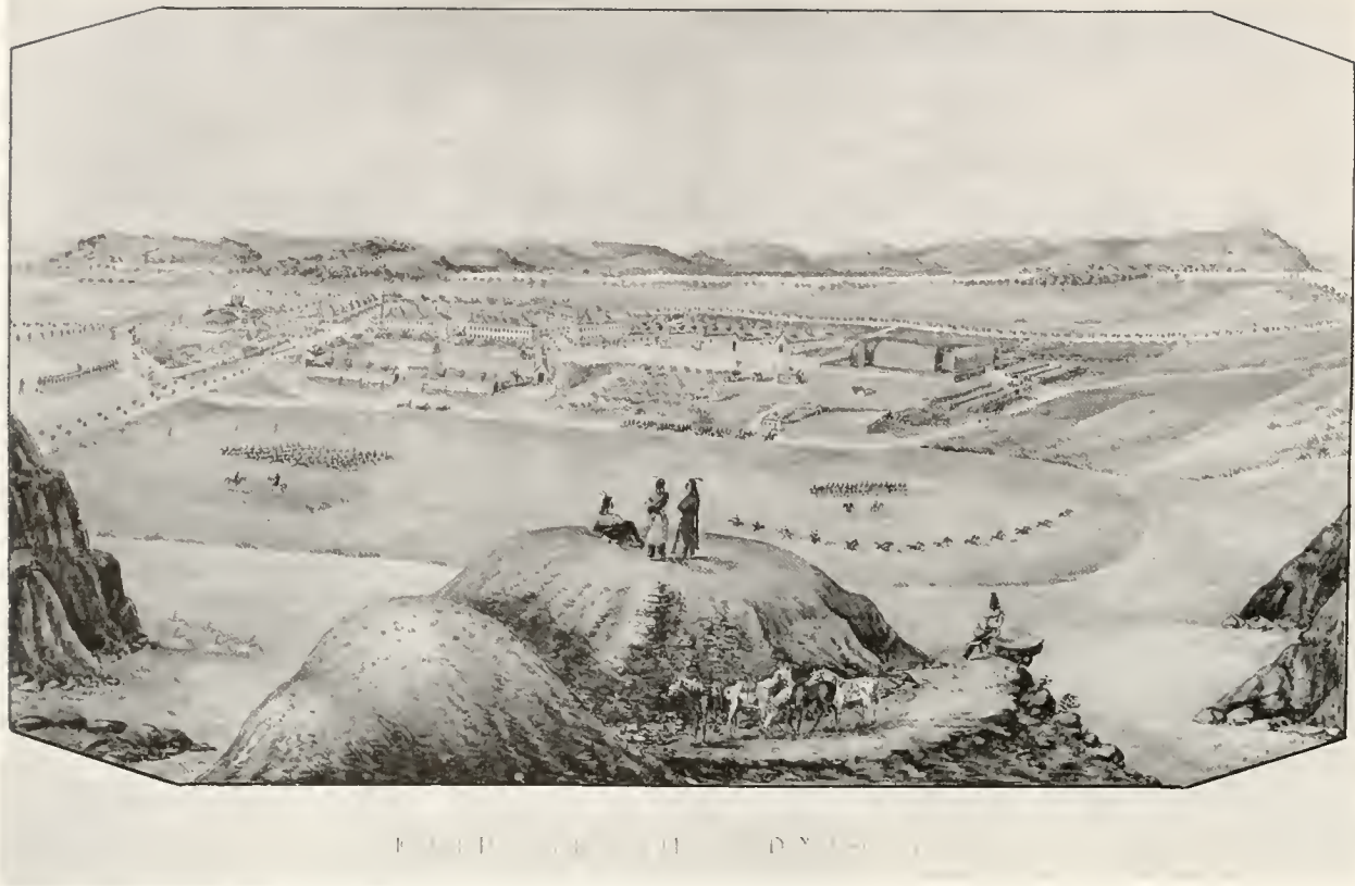
FORT KEOGH, MONTANA. (U.S.N.M. 384189; Smithsonian photo 37925.)