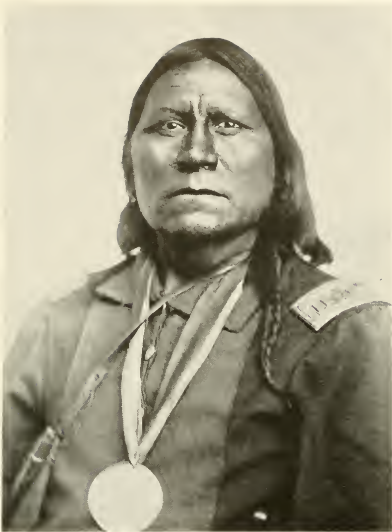
Figure 11.—Kiowa Chief Satanta, or White Bear.