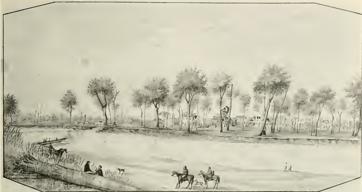
Miles City Montana