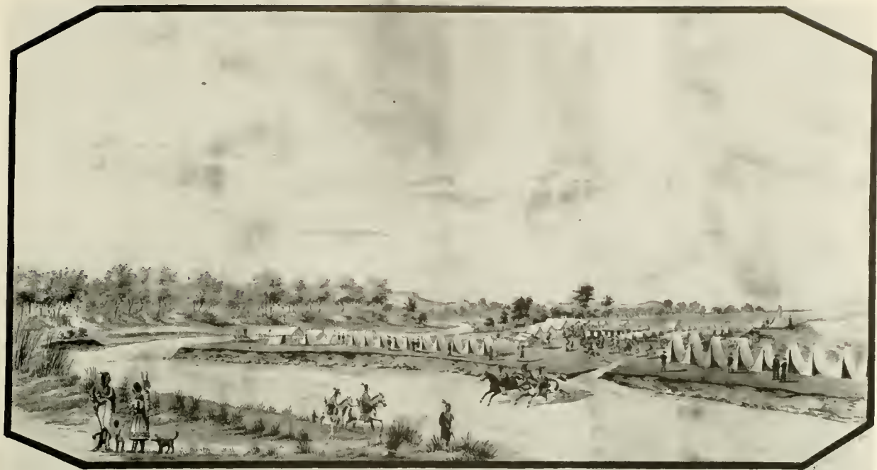
Camp of the Peace Commissioners at Medicine Lodge Creek