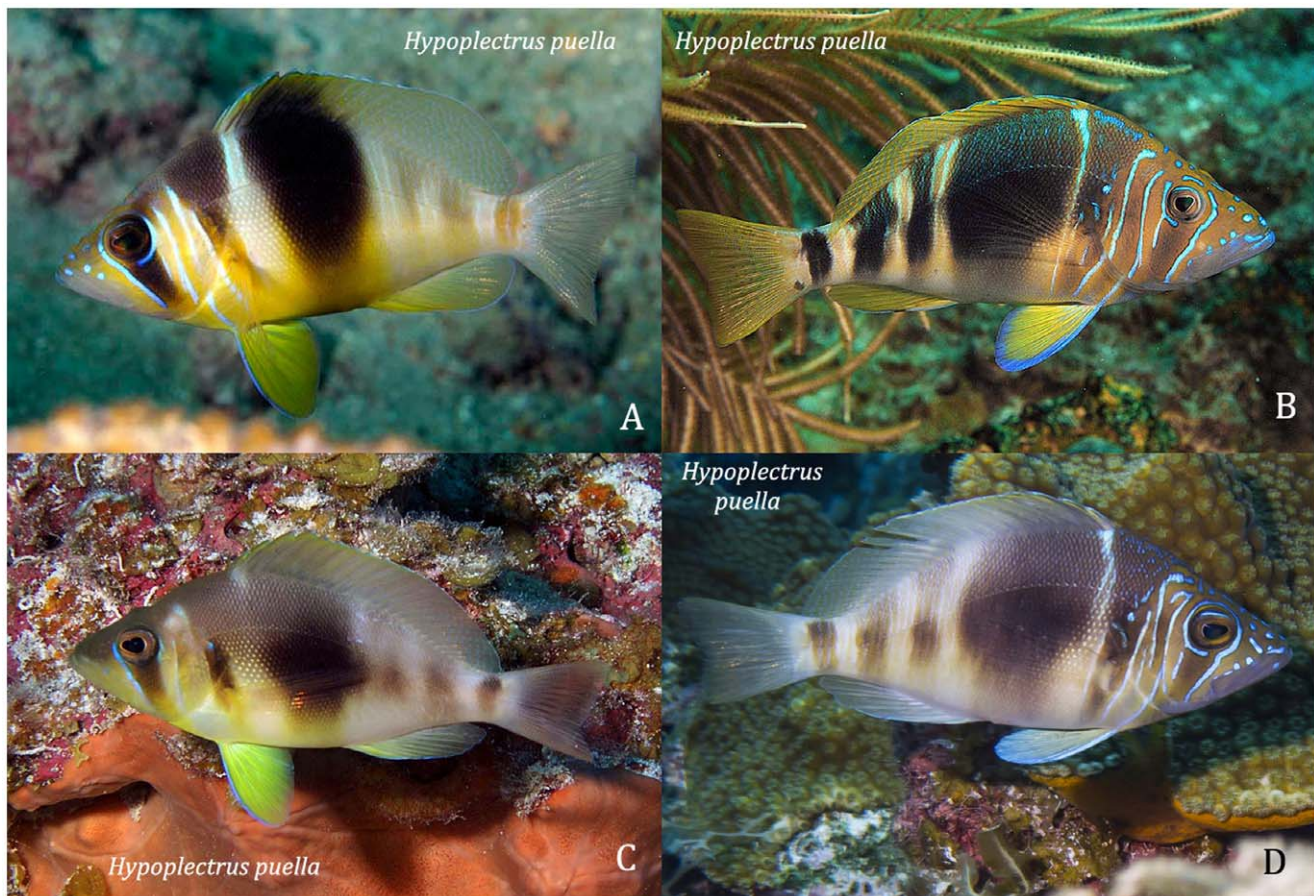
Figure 5. Four color variants of the barred hamlet, Hypoplectrus puella . doi:10.1371/journal.pone.0054939.g005

In Panama H. puella regularly acts as a follower of demersal feeding schools of a small parrotfish [49], [50]. H. puella , and other predatory fishes, take advantage of the fact that the compact parrotfish schools displace and mobilize prey organisms as they move slowly across the substrate pillaging the algal gardens of territorial damselfishes. Barred hamlets following parrotfish schools attack the small disturbed and distracted prey and have a much higher rate of predatory strikes than do solitary hunting individuals [50]. In both the hamlet and parrotfish brown hues predominate, with patterns composed of stripes and blotches in the elongate parrotfish, which is more dully colored when in schools than when defending territories [49], (DRR pers obs), and bars in the deep-bodied hamlet. Here a non-mimetic hamlet associates with a parrotfish that resembles it only in having generally similar color hues.