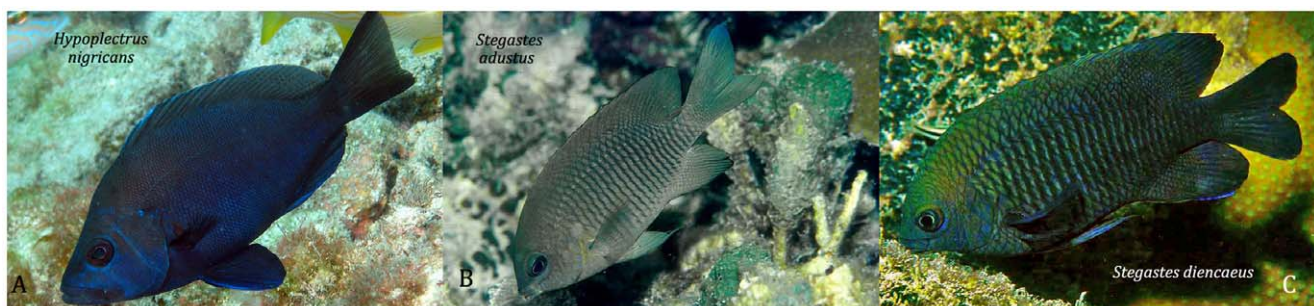
Figure 4. The black hamlet, Hypoplectrus nigricans , and its supposed damselfish models, the dusky damselfish, Stegastes adustus , and the longfin damselfish, Stegastes diencaeus .

Hypoplectrus puella . The barred hamlet is the commonest and most widespread member of the genus. It has a pale yellowish to tan head and body with up to 7 dark brown bars that vary in their occurrence, intensity and vertical extent (see Figure 5). The predominant colors are browns and yellows, but some individuals have blue tones. The large, conspicuous pelvic fins vary from yellow to dark bluish brown. The head and, occasionally, the body may have fine vertical iridescent blue lines (see Figure 5, and [33], [44], www.fishdb.co.uk and www.reefguide.org ). Thresher [42] described geographic variation in coloration of H. puella : the proportional abundances of four different barring patterns varied in different parts of the geographic range. If H. puella 's barred coloration is cryptic [42], then such geographic variation indicates that it may be less cryptic at some locations than others.