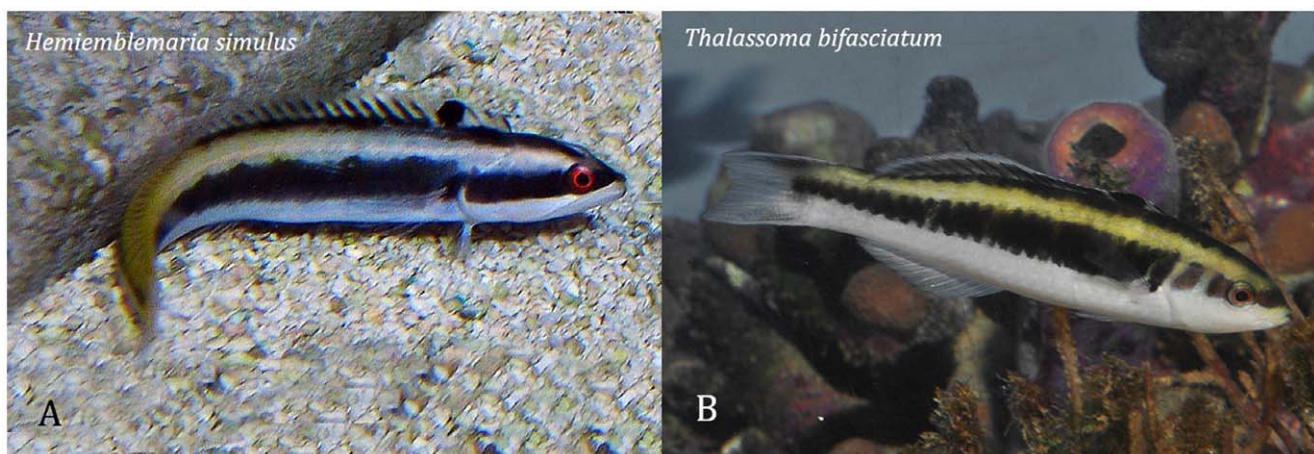
Figure 2. The wrasse blenny Hemiemblemaria similus , and its supposed model, the bluehead wrasse, Thalassoma bifasciatum .

Relative Abundance of “model” and “mimic”. H. similus is far rarer than the abundant bluehead wrasse, which is one of the commonest fish on Caribbean area reefs [3], [31], (DRR pers obs).