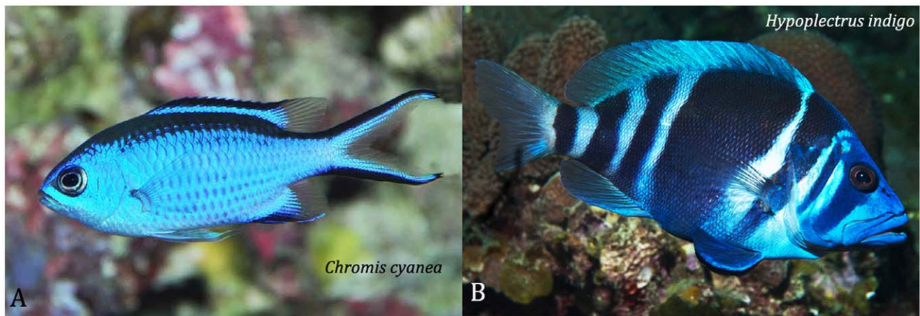
Figure 3. The indigo hamlet, Hypoplectrus indigo , and its supposed model, the blue chromis, Chromis cyanea .