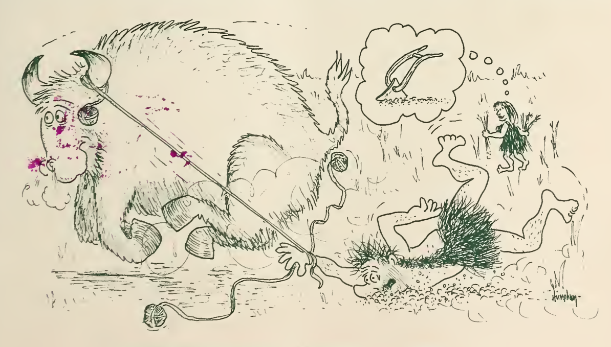
THE TRANSITION FROM HUNTING AND GATHERING TO DOMESTICATION

intervention in the life cycles of wild plants and animals. Plant domestication can be defined as the human creation of a new form of plant--one that is distinguishable