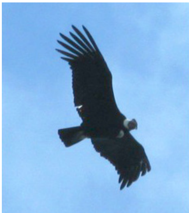
Figure 2. Male Andean Condor photographed on 19 July 2009 at Cerro el Barco.

Double-toothed Kite ( Harpagus bidentatus ). One adult male was collected on 14 June 2009 in tall evergreen forest along the trail from the Campo Verde to Cotrina Police Stations. This represents the first record of the species for western Peru, and a major southward range extension from previous sight records in central Guayas, n. Los Ríos, and w. Chimborazo, Ecuador (Ridgely & Greenfield 2001).