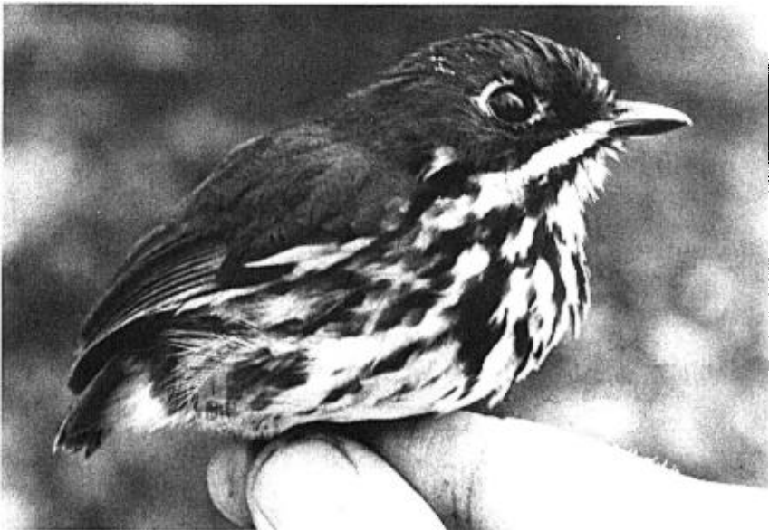
FIG. 1. Female Grallaricula ochraceifrons .

brown; axillars and carpal coverts light ochraceous buff. A thin buffy-white malar mark, bordered above and below by black, extends from the base of the bill posteriorly to lower lateral throat region; center of throat white, tinged faintly with buff and bordered laterally with black and buff feathers; feathers of upper breast and sides buff bordered laterally with wide black margins, producing a heavily streaked appearance; lower flanks indistinctly streaked olivaceous brown and dark brown; center of lower breast, belly, and undertail coverts white. Soft parts in life: iris dark brown; maxilla black, distal half of mandible black, light pink basally; tarsi and feet grayish pink.