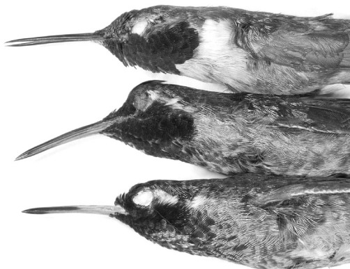
Fig. 1. Lateral views of adult males: Selasphorus platycercus (top), a probable hybrid (middle), Hylocharis leucotis × Selasphorus platycercus (AMNH No. 754805), and Hylocharis leucotis (bottom).

pigmentation on the head or flanks (Figs. 1–2; Appendix). Three of the potential parental species ( Selasphorus platycercus , S. rufus , S. sasin ) exhibit an emarginated outermost primary (P10).