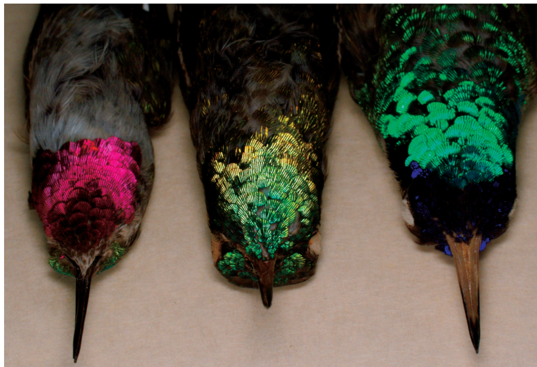
Fig. 2. Ventral iridescence of adult males: Selasphorus platycercus (left), a probable hybrid (middle), Hylocharis leucotis × Selasphorus platycercus (AMNH No. 754805), and Hylocharis leucotis (right).

Three potential parental species possess a red or reddish-orange bill (dull yellow in specimens) tipped with black: Amazilia violiceps ; Hylocharis leucotis ; and Cynanthus latirostris . A fourth species, A. beryllina , has reddish-orange at the base of the mandibular ramphotheca. This species can be quickly discarded from