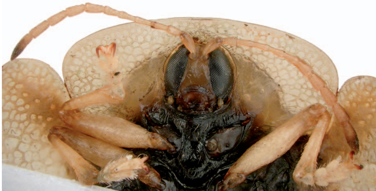
Figure 7. Plagiometriona centromaculata sp. nov.: (7): head, antennae, prosternum, and fore legs.

Material examined. Holotype, male, glued: 'BOLIVIA Santa Cruz dpt. | Florida prov. 9.–13.xii.2008 | Refugio los Volcanes | 18°06'S, 63°36'W, 1045 m | D. Windsor, S. Lingafelter & T. Henry lgt. [green, printed, cardboard label]' (deposited at the Natural History Museum, London, United Kingdom); 4 paratypes, glued and 2 in ethanol: same data as in holotype (preserved at the Department of Zoology, Faculty of Science, University of South Bohemia, Czech Republic and working collection of D. Windsor, Panamá City, República de Panamá); 2 paratypes, male and female, pinned: 'BOLIVIA: Prov. Florida | Dept. de Santa Cruz | Refugio los Volcanes | nr. Bermejo, 3,431 ft. [white, printed and cardboard label] | | S-18.10540°/W-63.59807° | Dec. 4/8, 2009 – A. J. Gilbert, | N. J. Smith & J. Aramayo | Bejarano [white, printed and cardboard label]'