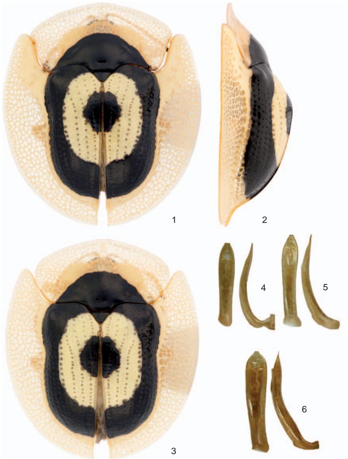
Figures 1–6. Plagiometriona centromaculata sp. nov.: (1) male dorsal; (2) male lateral; (3) female dorsal; (4) aedeagus dorsal and lateral; P. phoebe (Bhn.): (5) aedeagus dorsal and lateral; P. hyalina sp. nov.: (6) aedeagus dorsal and lateral.