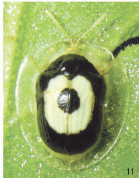
Figures 8–11. Plagiometriona centromaculata sp. nov.: (8, 9) host plant Solanum sp. (Solanaceae); (10) third instar larva; (11) living specimen on its host plant.