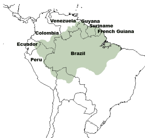
Fig. 1. The Amazon Basin in South America is comprised of areas of Brazil, Bolivia, Peru, Ecuador, Colombia, Venezuela, Guyana, Suriname, and French Guiana. Approximately 4,100,000 square kilometers (50%) of the forested area is located in Brazil

One of the consequences of deforestation is forest fragmentation, an ever-increasing global phenomenon affecting the persistence of healthy forest ecosystems across the planet [9]. Forest fragmentation occurs when sections of contiguous forest are cleared, thereby leaving a mosaic of patches surrounded by a non-forested matrix. As deforestation for agriculture or urban development continues, the remaining forest becomes increasingly patchy, affecting local climate [10, 11], species richness and distribution [10, 12, 13], predator-prey interactions [14], seed dispersal [15, 16], and habitat suitability [17, 18].