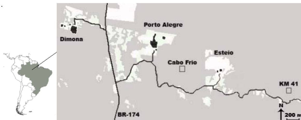
Fig. 3. The Biological Dynamics of Forest Fragments Project (BDFFP) is located approximately 80 km north of Manaus, the capital of the state of Amazonas. Forest fragments are located throughout three cattle ranches, or fazendas , Dimona, Porto Alegre, and Esteio. Cabo Frio and Km 41 are two continuous forest sites. Fragments are black, clear-cut areas and secondary forest areas are white, and old growth forest is gray. The SUFRAMA colonization plan would settle families within the area of BDFFP

Six primate species reside in the BDFFP study area: red howler monkey ( Alouatta seniculus ), black spider monkey ( Ateles paniscus ), brown capuchin monkey ( Cebus apella ), brown bearded saki ( Chiropotes satanas chiropotes ) 1 , white-faced saki monkey ( Pithecia pithecia ), and golden-handed tamarin ( Saguinus midas ). Although research at BDFFP has been ongoing since 1979, primate research in the forest fragments has been sporadic, with in-depth behavioral and ecological research only on red howler monkeys [35-40], white-faced saki monkeys [41-43], and bearded saki monkeys [44]. Therefore, there is still much to learn regarding the responses of the primates to forest fragmentation.