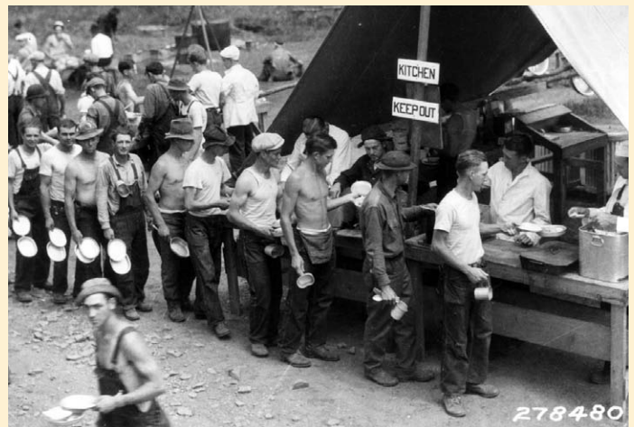
A Civilian Conservation Corps mess line, undated

While some federal organizations have stand-alone programs with the resources to collect professionally recorded oral histories, most do not. My work has been primarily with the U.S. Department of Agriculture Forest Service, a 105-year-old agency with a very distinctive culture. Its primary mission is to manage public forest and grasslands. Although the agency recognizes the value of oral history, few resources are allocated for that work. One of the ways that the Forest Service in Region 6, Oregon and Washington, has been able to collect oral histories is through a partnership with Portland State University (PSU). From 2000 to 2003, my students and I worked with the agency to collect oral histories of former Forest Service workers from the 1920s through the 1960s. Our project—Voices from the Forest—was organized as a PSU capstone course. Capstone courses are multidisciplinary