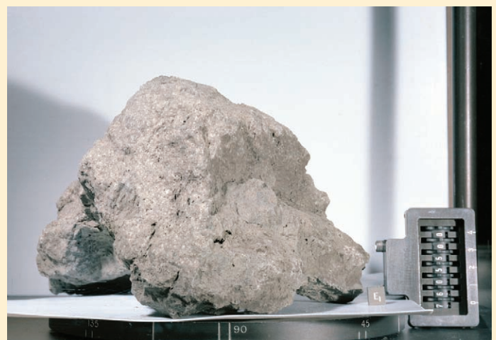
An Apollo 17 lunar rock sample No. 76055 being studied and analyzed in the Lunar Receiving Laboratory at the Manned Spacecraft Center. This tan-gray irregular, rounded breccia was among many lunar samples brought back from the Taurus-Littrow landing site by the Apollo 17 crew. The rock measures 18 x 20 x 25 centimeters (7.09 x 7.87 x 9.84 inches) and weighs 6,389 grams (14.2554 pounds).

The NASA Headquarters Historical Reference Collection (HRC) fills approximately 2,000 cubic feet, offering a glimpse into the agency's rich and vast history. The HRC, maintained in Washington DC, is arranged by subject but also includes a small audiovisual collection and hundreds of biographical files on individuals important to the history of NASA and NACA, its predecessor organization. The HRC contains copies of historically significant correspondence, memoranda, reports, photographs, and other materials; whereas, the Agency's official, permanent records are mandated by law to be