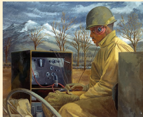
A signalman uses a radio in the field to communicate with American troops in Ludwig Mactarian's 1945 gouache on paper, Radioman.

The Army Art Collection has roots dating back to World War I, when the Army implemented its first art program. The Army commissioned eight artists in the Corps of Engineers and sent them to Europe with American Expeditionary Forces to document America's participation in the war. After the war, the Army had no facility or staff for the art, so it was donated to the Smithsonian Institution. During World War II, the Army revived the program and sent 43 artists, both military and civilian, into the field. Congress however, cut funding for the program in 1943—soldier-artists remained with their units while the civilians were employed by Life magazine. The following year, however, Congress reversed its decision and allowed soldier-artists to begin producing art again, as long as it did not interfere with their normal duties. After