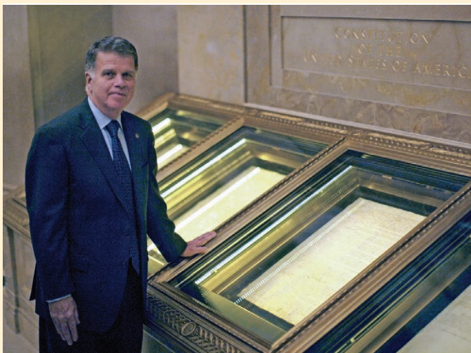
Archivist David S. Ferriero with the Charters of Freedom

Today, the majority of federal records being created are electronic records. Essential to managing these electronic records is developing cost-effective electronic records management tools that work—then integrating them into agency IT systems. Most agencies develop IT systems without thinking about records. Later, they must go back and spend more money to capture, preserve, and provide access to the records. Or—the records are simply lost and cannot be used over time. To improve this situation, we recommend that records management experts be included in the design and development of information systems. Accordingly, we at NARA are focusing on reclaiming our records management leadership role by finding, encouraging, and sharing cost-effective IT solutions needed to meet the electronic records management challenges of today and the future. This fall, Vivek Kundra and I will be co-hosting a joint meeting of the Chief Information Officers Council and the Federal Records Council at the