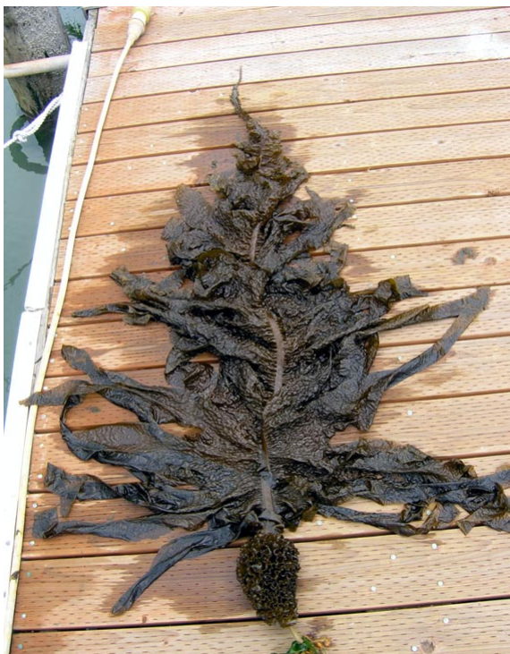
Figure 2. Undaria pinnatifida from the East Harbor of SF Marina.

a mean of 102 cm. All but 14 of the individuals were reproductive. Larger thalli were showing signs of dis-integration. This population had a high density center focused around 40 berths about mid-way down the dock, and edges past which we did not find any individuals.