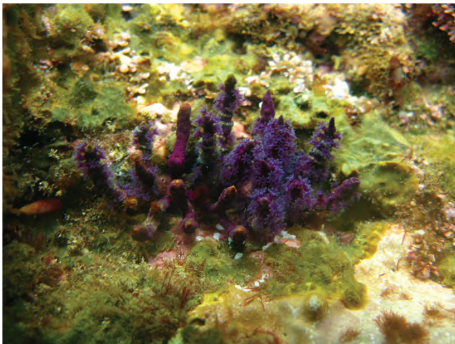
Figure 2. Leptogorgia ena sp. nov., in situ photograph, El Faro, 12 m depth.

Etymology .—From Greek ένα, number one, in allusion to the species reference name given in the field during the ecological studies (Lepto1).