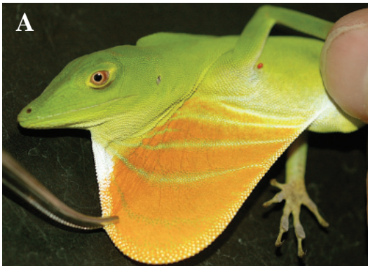
Figure 3 - Dewlaps of male (A) and female (B) Anolis ibanezi sp. nov.