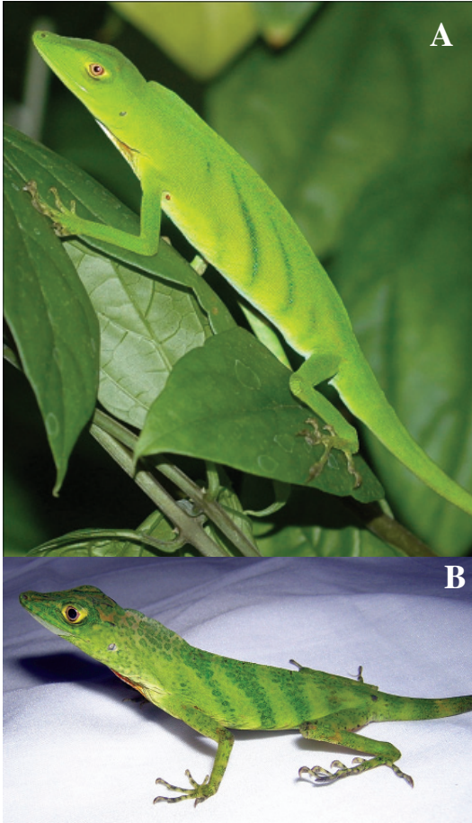
Figure 1 - (A) Adult male Anolis ibanezi sp. nov. (B) Adult male Anolis chocorum .