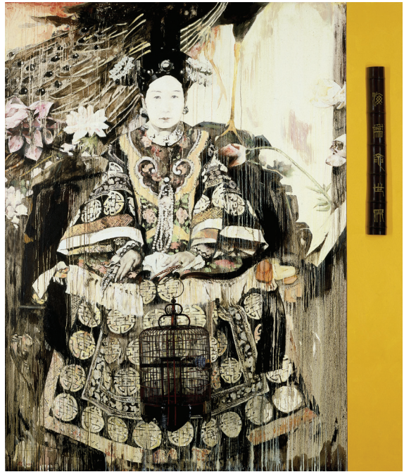
5. Hung Liu, The Ocean is the Dragon's World , 1995. Oil on canvas, painted wood panel, metal support rod, and metal bird cage with wood and ceramic appendages, 97 × 82 1/2 × 17 3/8 in. Smithsonian American Art Museum, Washington, DC, Museum purchase in part through the Lichtenberg Family Foundation.

Hung Liu (b. 1948) came of age in China during the Cultural Revolution and witnessed the government's attempt to sever the country's ties to its past through the widespread destruction of historical artifacts and cultural sites. Her paintings are often inspired by once-forgotten archival photographs. Painted nearly a century later than Katherine Carl's life portrait of the empress dowager, The Ocean is the Dragon's World (Figure 5) echoes the composition of a formal royal portrait. Whereas Carl was restricted by the desires of her sitter and conventions of Chinese portraiture, Liu's painting is based on a photograph now in the collection of the Palace Museum, Beijing, and reveals her contrasting creative freedom. Here, Cixi's face is left nearly featureless, so the artist can focus instead on her opulent costume and surroundings. She holds a birdcage—a real object that emerges from the surface of the canvas—which might hint at the cloistered life of Chinese royalty. 27 Liu's paintings were featured in the museum's 1996–97 exhibition American Kaleidoscope: Themes and Perspectives in Recent Art and related catalogue, and senior curator Joann Moser interviewed her in 2010 for the Archives of American Art's oral history repository.