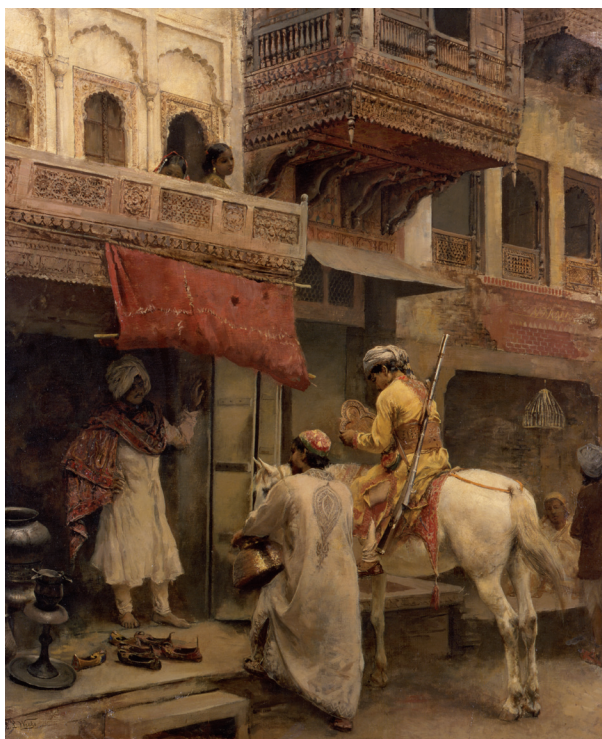
1. Edwin Lord Weeks, Street Scene in India , ca. 1884–88. Oil on canvas, 28 7 / 8 × 23 3 / 4 in. Smithsonian American Art Museum, Washington, DC, Bequest of Harriet Lane Johnston.

of large numbers of Chinese immigrants at mid-century, an anxiety that manifested itself in the Chinese Exclusion Act of 1882. Almost concurrent to the Exclusion Act is Theodore Wores's The Chinese Fishmonger (see Mills, Figure 1), depicting San Francisco's Chinatown. Completed just after Wores's return to San Francisco from training in Munich, this deep-hued and richly textured painting opened the door for further picturesque depictions of the exotic ethnic quarter. 2