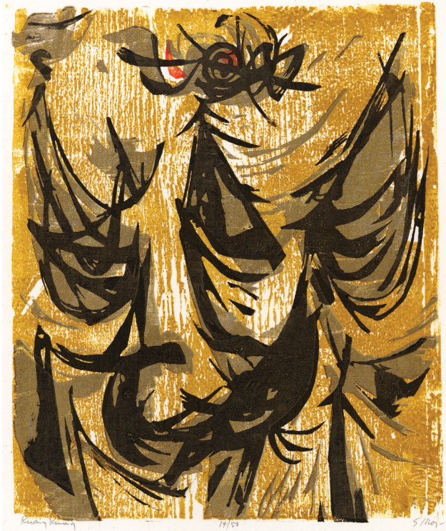
4. Seong Moy, Kuang Kung , 1952. Color woodcut on paper, 14 1/8 x 12 in. Smithsonian American Art Museum, Washington, DC, Gift of the artist.

Contemporary with such abstract prints but more traditional in style are the works of Japanese-born master woodcutter Un-ichi Hiratsuka (1895–1997). Hiratsuka was