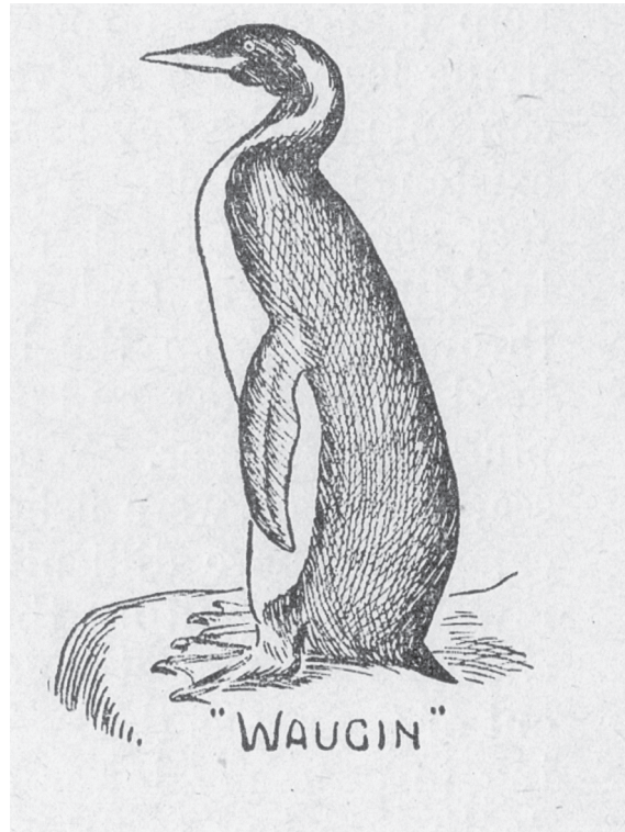
Figure 1. Sketch of a “Waugin” from Beane (1905: 91). In the book, this appeared in his account of Amsterdam Island, where only the rockhopper penguin ( Eudyptes chrysocome ) occurs, which this certainly is not. The neck adornment indicates a king penguin ( Aptenodytes patagonicus ), so the original sketch was probably made at Kerguelen Island, which was also visited by Beane and where king penguins are common.