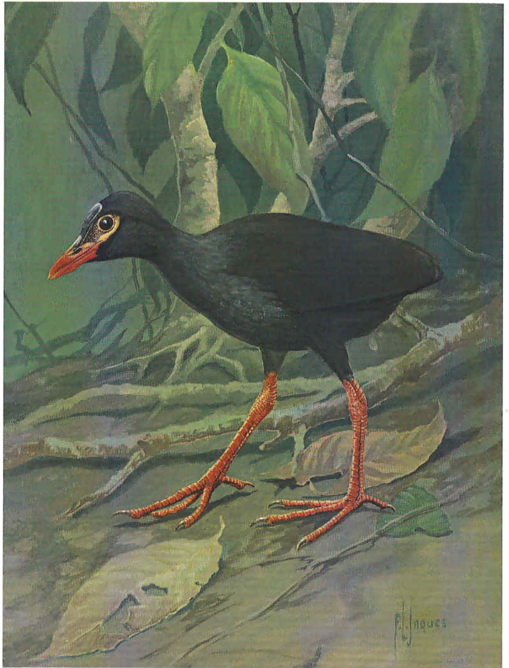
The gallinule Pareudiastes ("Edithornis") silvestris (Mayr). From a painting by F. L. Jaques in the American Museum of Natural History.