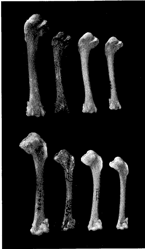
FIG. 1. Anconal (top row) and palmar (bottom row) views of humeri of woodcocks and snipe. Left to right: Scolopax rusticola , S. anthonyi , S. minor , Capella gallinago . Natural size.

that of S. minor , in a number of its characters it more closely resembles that of S. rusticola (Fig. 1). The large ectepicondylar process typical of most shorebirds is reasonably well-developed in S. rusticola , projecting externally in a dis-