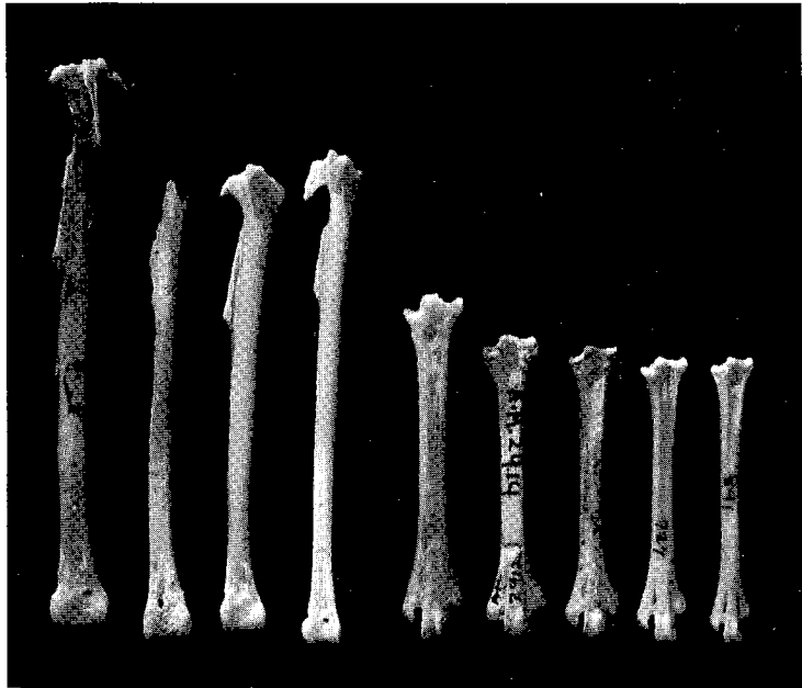
FIG. 4. Anterior view of hindlimb elements of woodcocks and snipe. Left to right: tibiotarsi of Scolopax rusticola , S. anthonyi , S. minor , Capella gallinago ; tarsometatarsi of S. rusticola , S. anthonyi (2 individuals), S. minor , C. gallinago . Natural size.

before the North American population of Scolopax had evolved the advanced conditions now seen in S. minor . Thus, S. anthonyi preserves the primitive features still found in the Old World forms of Scolopax . It must have been resident in Puerto Rico for a considerable period of time.