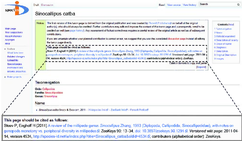
Figure 1. Citation template for the simultaneous journal and wiki publication of Sinocallipus catba Stoev & Enghoff, 2011 (generic link: http://species-id.net/wiki/Sinocallipus_catba , permanent link of the version depicted in the figure: http://species-id.net/w/index.php?title=Sinocallipus_catba&oldid=4534 ). The generic link always points to the most recent version of the page, while a permanent link is specific to one particular revision.

ogy and others) into sections of the wiki page. In addition, it converts reference lists and identification keys, exports taxon images and places them on the wiki page. At the same time, the PWC uses several wiki templates to facilitate the display of recommended citations, taxonomic classifications and other content elements in a way that is consistent across the site and easily editable as well. Several of the hyperlinks present on