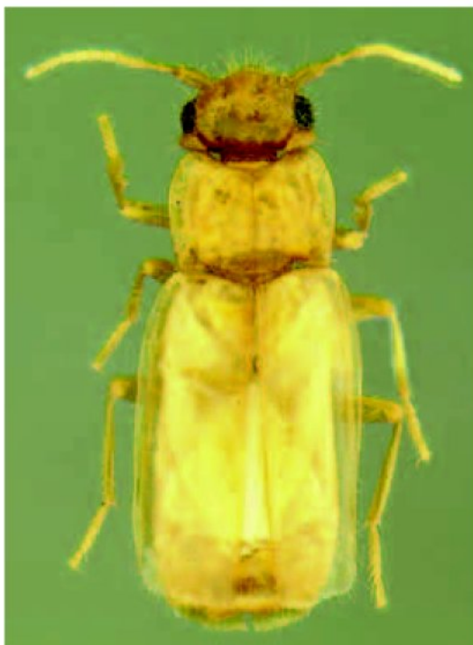
FIGURE 1. Xenaroswelliana deltaquadrant Erwin, male, dorsal aspect.