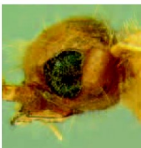
FIGURE 3. Xenaroswelliana deltaquadrant Erwin, male, head, lateral aspect.

sparsely setiferous. Metathoracic wing fully developed, no doubt functional. Trochanter narrowed apically, acute. Abdomen: Sternum III-IV fused. All visible sterna sparsely setiferous on disk, each with numerous long stout setae along apical margin. Male genitalia: (Fig.