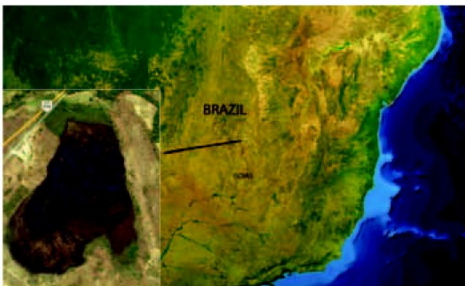
FIGURE 5. Geographic distribution map for Xenaroswelliana deltaquadrant Erwin with aerial view of marsh at the type locality along Brazil's Highway 20 in Goiás State, Brazil.

GEOGRAPHIC DISTRIBUTION. — (Fig. 5). This species is known only from the type locality.