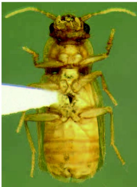
FIGURE 2. Xenaroswelliana deltaquadrant Erwin, male, ventral aspect.

Elytral interneurs micropunctate (difficult to observe); interval setigerous pores moderately closely spaced, moderately coarsely impressed. Metepisternum longer than wide, surface sparsely setiferous.