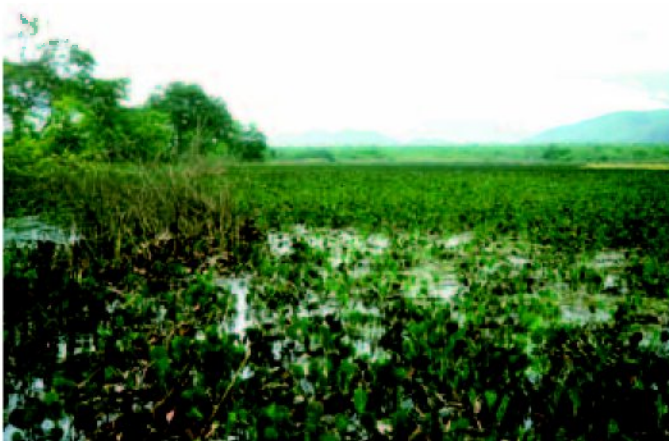
FIGURE 6. The vegetation and water body at the type locality in Goiás State, Brazil.