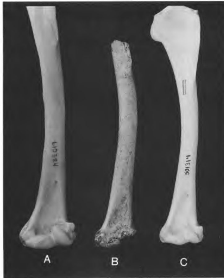
Fig. 4. Humeri of Bubo in palmar view. A, B. bubo (USNM 610384) female, largest available specimen of the species; B, B. osvaldoi , new species (USNM 447023); C, B. virginianus (USNM 501314), female. Figures three-fourths natural size.

known localities), Nyctea scandiaca (2 males and 2 females; Alaska, Maryland, and District of Columbia). The following specimens of Scotopelia in the American Museum of Natural History were measured and examined for us: S. peli (2 unsexed; Zaire), S. bouvieri (1 unsexed; Zaire), S. ussheri (1 female; Sierra Leone).