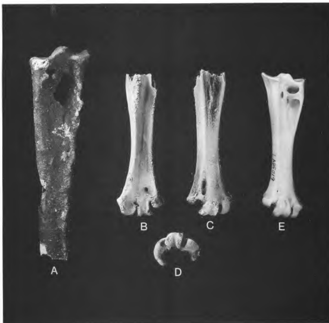
Fig. 1. Tarsometatarsi of strigid owls. A, anterior view of Ornimegalonyx oteroi (MNHN unnumbered, lacking distal end), showing the immense size compared to otherwise very large owls; B, C, D, posterior, anterior, and distal views of Bubo osvaldoi , new species, holotype (MNHNCu-27, coated with ammonium chloride to enhance detail); E, anterior view of B. bubo (USNM 610384) female, largest available specimen of the species. Figures three-fourths natural size.

proportionately short, robust tarsometatarsus, the more anteroposteriorly expanded external condyle of the femur, and the shallower brachial depression of the humerus.