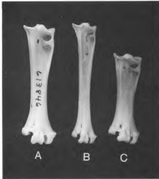
Fig. 5. Tarsometatarsi of Bubo in anterior view to show the great differences in proportions between various species. A, B. virginianus (USNM 613846); B, B. africanus (USNM 490288); C, B. sumatranus (USNM 559827). Figures three-fourths natural size.

sometatarsus, in Bubo . Compared to B. bubo , the tarsometatarsus in B. africanus , for example, is quite long and slender, whereas that in B. sumatranus is extraordinarily short and stout (Fig. 5). That of B. osvaldoi is of more typical proportions and is similar to that of B. bubo .