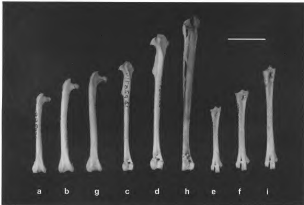
Fig. 5. Comparison of hindlimb elements in anterior view of Rallus recessus , new species (a–f) with R. elegans (g–i—USNM 499437 female). a, b, right femora UF PB5036, UF PB5309; c, d, right tibiotarsi UF PB5941, UF PB5722; e, f, right tarsometatarsi UF PB5796, UF PB5800. Scale bar = 2 cm.

was a derivative of Rallus elegans that had become adapted to somewhat higher salt stress, rather than a derivative of R. longirostris . According to Olson's hypothesis, R. elegans was the original North America stock of large Rallus that was later displaced from Gulf and Atlantic salt marsh habitats by an invasion of R. longirostris . Although the salt-marsh Clapper Rail, R. longirostris , has been found as a very rare vagrant to Bermuda, the King Rail, R. elegans , has not yet been recorded there (Amos 1991).