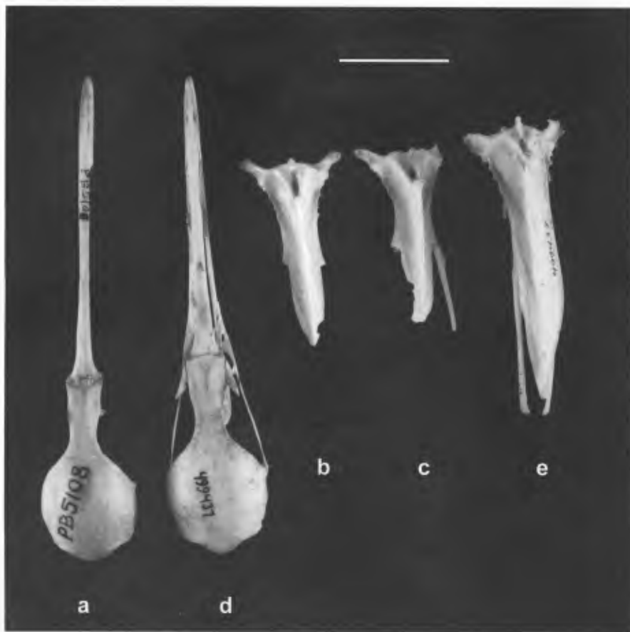
Fig. 2. Comparison of skulls in dorsal view ( a , d ) and sterna in ventral view ( b – c , e ) of Rallus . a , R. recessus , new species, holotype UF PB5108; d , e , R. elegans female USNM 499437; b , c , R. recessus , new species, UF PB5124, UFPB 5126. Scale bar = 2 cm.

length, 93.6; rostrum from nasofrontal hinge to tip, 62.7; length of premaxillary symphysis, 21.1; length of cranium from naso-frontal hinge, 33.1; width of cranium at postorbital processes, 17.0; width of interorbital bridge 4.8.