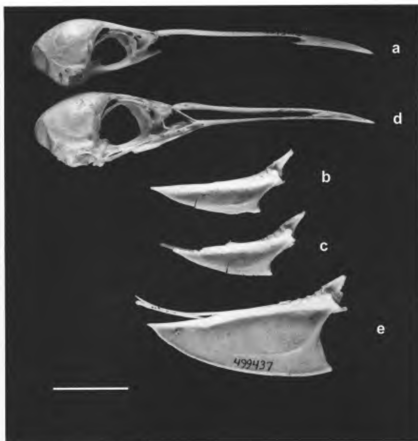
Fig. 1. Comparison of skulls ( a, d ) and sterna ( b-c, e ) of Rallus in lateral view. a, R. recessus , new species, holotype UF PB5108; d, e, R. elegans female USNM 499437; b, c, R. recessus , new species, UF PB5124, UF PB5126. Scale bar = 2 cm.

icola 489973, 525915, 525917; R. elegans 499437, 525886, 610780, UF 22870, UF 24314, UF 24318; R. longirostris 525876, 525873, 525879; R. longirostris × R. elegans 525887.