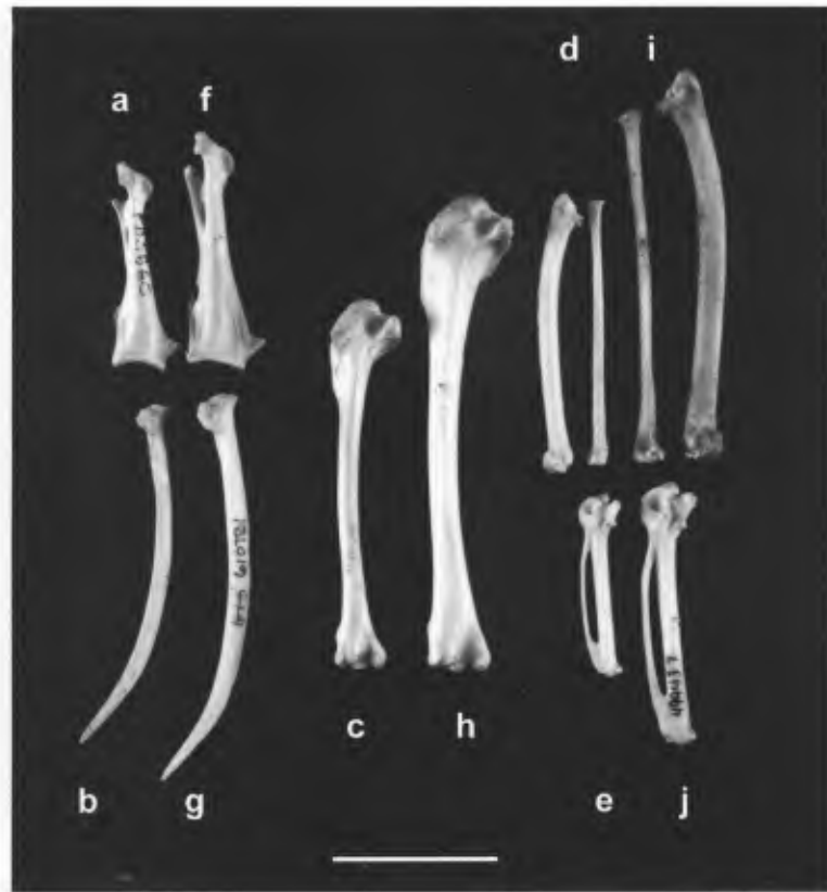
Fig. 3. Comparison of pectoral and wing elements of Rallus recessus , new species (a–e) with R. elegans (f, i, j, USNM 499437 female; g, h, USNM 610781 female). a, f, left coracoids in ventral view (a, UF PB 5860); b, g, left scapulae in dorsal view (b, UF PB5385); c, h, left humeri in anconal view (c, UF PB5160); d, left ulna and radius in internal view (ulna UF PB 5214; radius UF PB 5856); i, right ulna and radius in internal view; e, j, left carpometacarpi in internal view (e, UF PB5340). Scale bar = 2 cm.

symphysis, 21.1, 21.1, 21.6, 22.0. Scapula: length 42.4. For other measurements see Table 1.