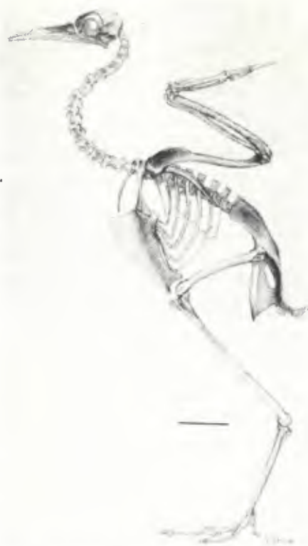
Fig. 2. Reconstructed skeleton of a volant, early Tertiary paleognathous bird based mainly on fossils from the Paleocene of Montana. Scale, 4 cm.

The new fossil birds reported here are probably remnants of what may have been a diverse radiation of paleognathous carinates that preceded, and were possibly ancestral to, the later radiation of neognathous birds. Tinamous and ratites may have descended independently from various families or orders within this radiation of paleognaths, or some of the ratites may have evolved secondarily from neognathous birds through neote-