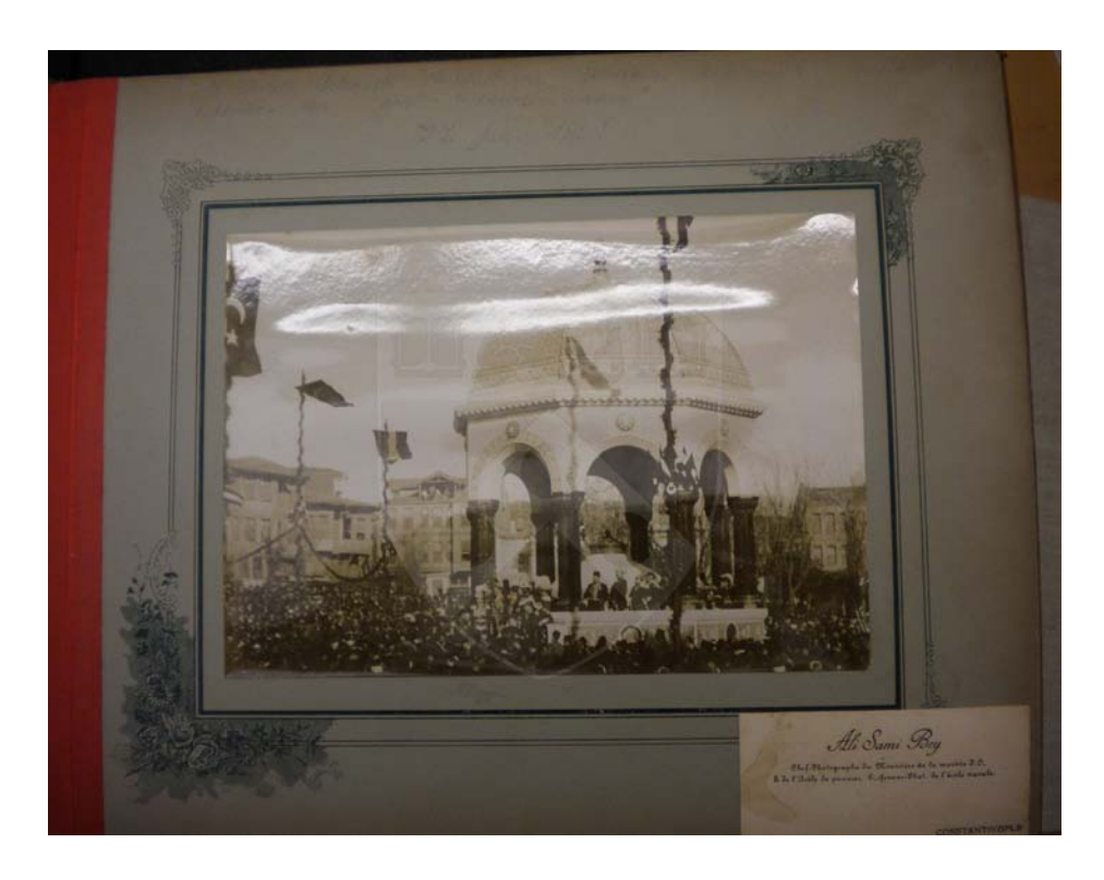
Figure 2: Album, page 1, Research Library, The Getty Research Institute, Los Angeles, California (96.R.14, Box 37)