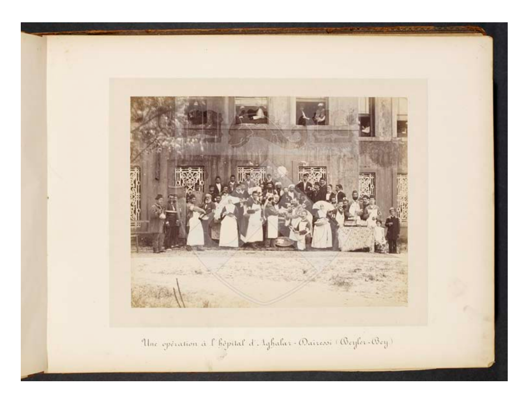
Figure 7: Album, page 14, Research Library, The Getty Research Institute, Los Angeles, California (96.R.14, Box 20)