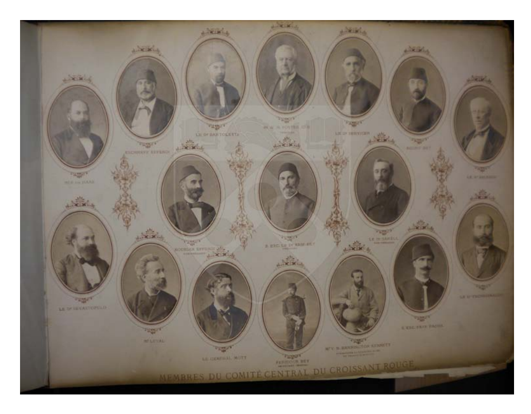
Figure 5: Album, cover, Research Library, The Getty Research Institute, Los Angeles, California (96.R.14, Box 20)