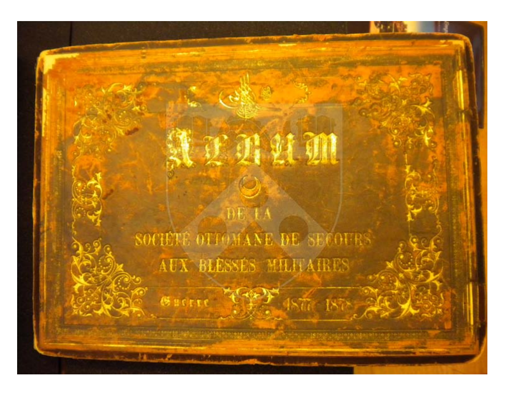
Figure 4: Album, cover, Research Library, The Getty Research Institute, Los Angeles, California (96.R.14, Box 20)