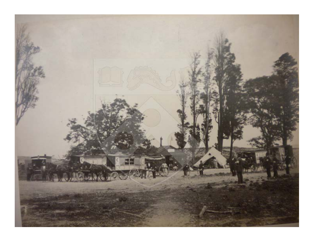
Figure 6: Album, page 14, Research Library, The Getty Research Institute, Los Angeles, California (96.R.14, Box 20)