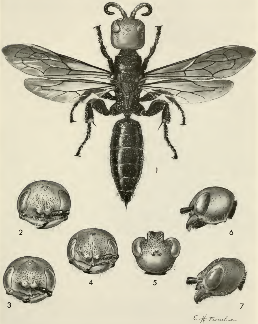
FIGURES 1-7.—1, Hylomesa longiceps (Turner), dorsal view, female, Anshi, India, \times 3.6 . 2, H. shuckardi (Turner), frontal view, female head, Marang, Burma, \times 6.9 . 3, H. tricolor tricolor (Smith), frontal view, female head, Sandakan, Borneo, \times 6.2 . 4, H. tricolor liefjunki Krombein, holotype, frontal view, female head, Mt. Semeroe, Java, \times 5.3 . 5, H. dimidiaticornis (Bingham), dorsal view, male head, Yakorubi, India, \times 9.7 . 6, H. shuckardi , lateral view, female head, Marang, \times 6.9 . 7, H. tricolor tricolor , lateral view, female head, Sandakan, \times 6.2 .