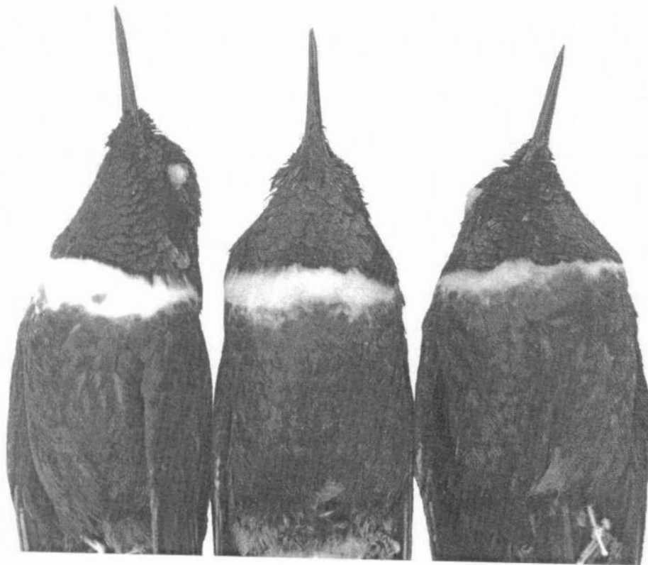
Fig. 1. Ventral view of the holotype of Heliangelus violicollis (BMNH 1887.3.22.901) flanked by male Heliangelus strophianus in definitive plumage.