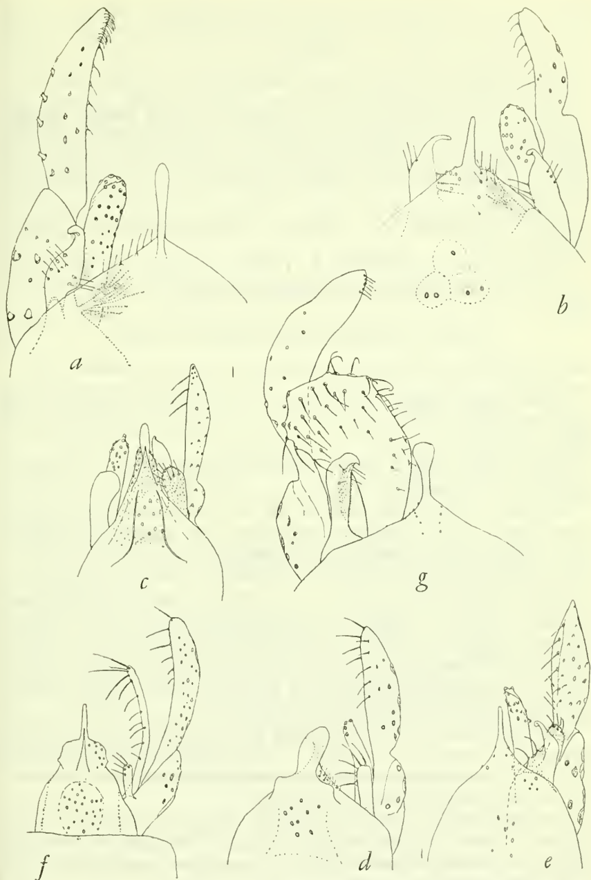
FIGURE 1.—Male genitalia: a , Paratendipes fuscitibia , new species; b , Paratendipes thermophilus Townes; c , Polypedilum ( Polypedilum ) labeculosum (Mitchell); d , Polypedilum ( Polypedilum ) californicum , new species; e , Polypedilum ( Polypedilum ) subcultellatum , new species; f , Stenochironomus totifuscus , new species; g , Tendipes ( Wirthiella ) modocensis , new species.