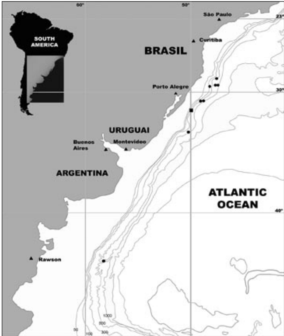
Fig. 3. Distribution of Monohetrochus capitoli gen. nov., spec. nov. Holotype and paratypes indicated by, respectively, a square and full circles.

and illustrations of O. rotundifolia were published by Cairns (1979: 73-75, pl. 10, figs 7-9, pl. 11, figs. 1-4, map 16; 2000: 106-107, figs 117-120).