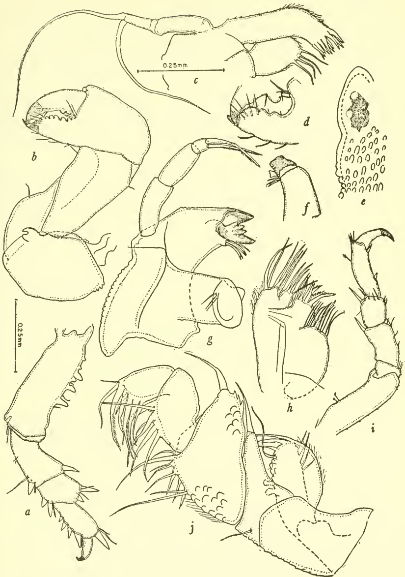
FIGURE 42.— Synapseudes intumescens , new species, female paratype (except where indicated): a , Second pereopod, right; b , gnathopod, left; c , first maxilla, right; d , gnathopod, left (male paratype); e , eye region, left; f , incisor process, right mandible; g , left mandible; h , second maxilla; i , seventh pereopod, right; j , maxilliped, right. (Magnification: a , b , d , i , as given for a ; all others as given for c .)