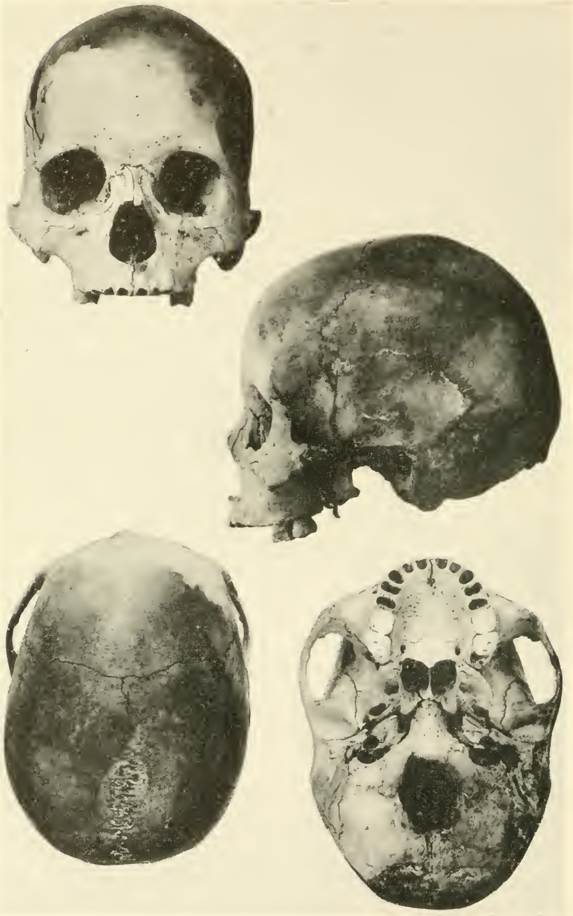
Four views of undeformed male (?) skull U. S. N. M. No. 265105, from the Chicama Valley. Oriented in the Frankfort position.