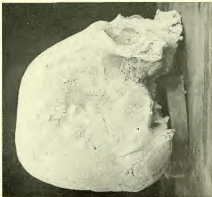
Two views of Cupisnique skull No. 12 from Barbacoa, showing the marked fronto-occipital deformity.