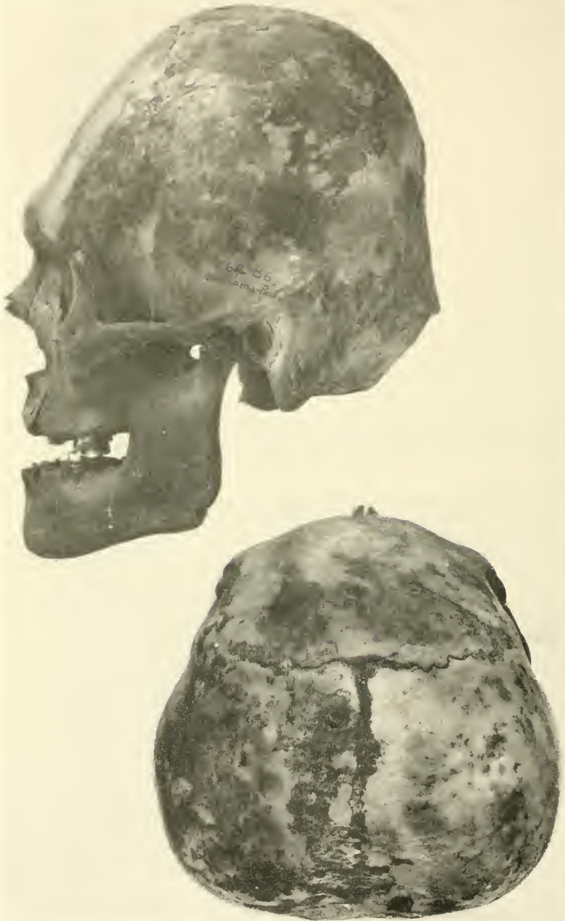
Two views of deformed male skull U. S. N. M. No. 264586 from the Chicama Valley. Oriented in the Frankfort position.