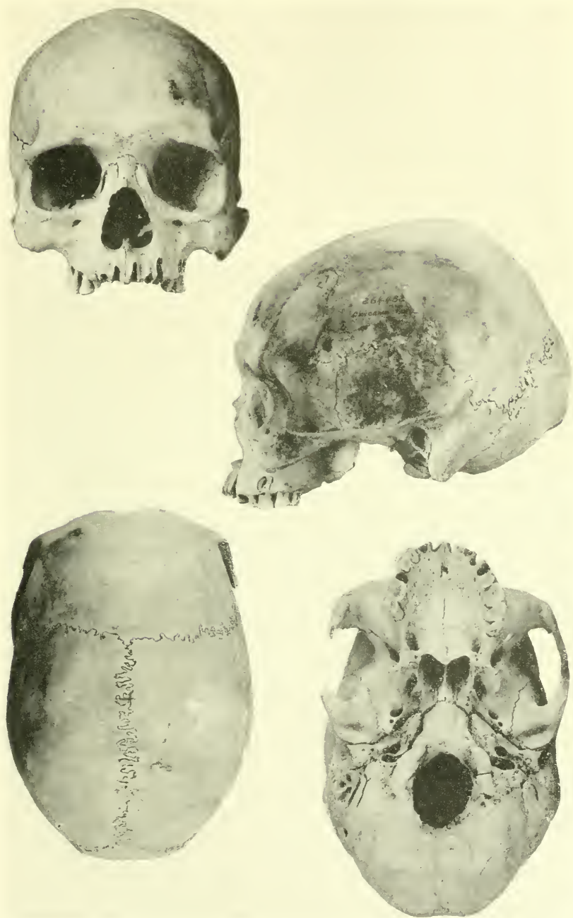
Four views of undecomposed male skull U. S. N. M. No. 264482, from the Chicama Valley. Oriented in the Frankfort position.