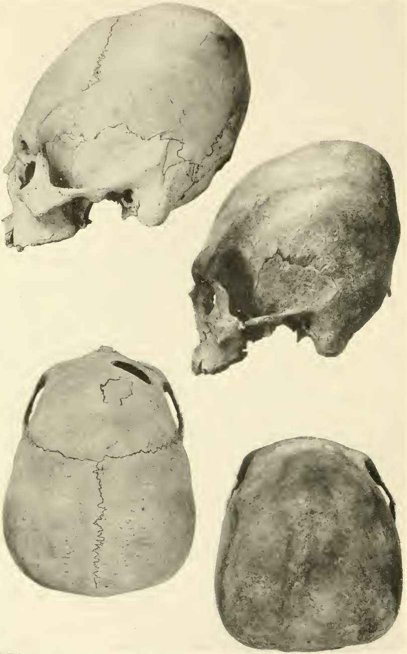
The side and top views of two deformed male skulls from Paracas. Oriented in the Frankfort position. Left, U. S. N. M. No. 379255, from Cabeza Larga; right, U. S. N. M. No. 379254, from Cerro Colorado.