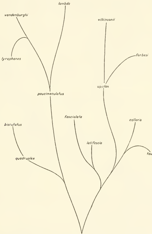
FIGURE 37.—Diagram of the possible phylogeny of Trimorphodon .

Obviously this succession of pattern types ( paucimaculatus to vandenburghi to lyrophanes to lambda ) is not to be considered as an indication of a similar succession in species evolution, for the morphology here shows otherwise. Certainly lyrophanes and vandenburghi have been isolated for a long period from paucimaculatus , since in them has been developed a spineless (i. e., very minute