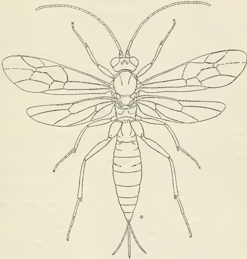
FIGURE 15.— Apotemnus truncatus , new genus and species.

Abdomen shining, weakly and minutely alutaceous, with fine sparse punctation; ovipositor sheath hardly as long as first two tergites.