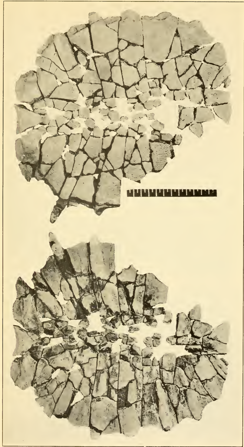
NEARLY COMPLETE CARAPACE OF AMYDA VIRGINIANA (CLARK)