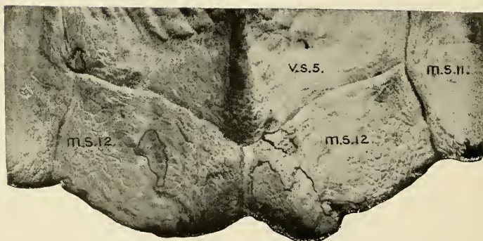
CARAPACES OF CHELYS AND CLEMMYS INSCULPTA