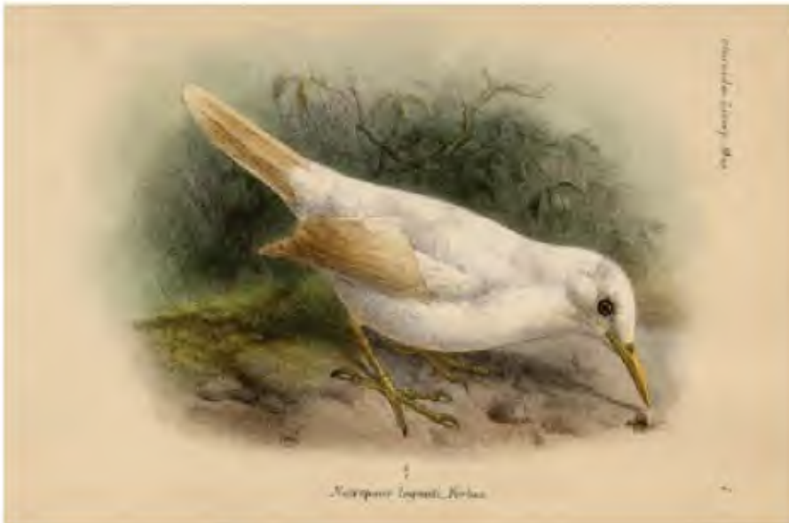
Figure 1. The first published illustration of Necropsar leguati , from Forbes (1898)

This single specimen became the focus of one unfounded assumption after another, compounded by some over-vigorous imaginations and lack of any careful subsequent scientific scrutiny, which led to the development of what in hindsight can only be regarded as a myth. With the true identity of this specimen now at hand, its entire written history can be summed up as a banquet of codswallop.