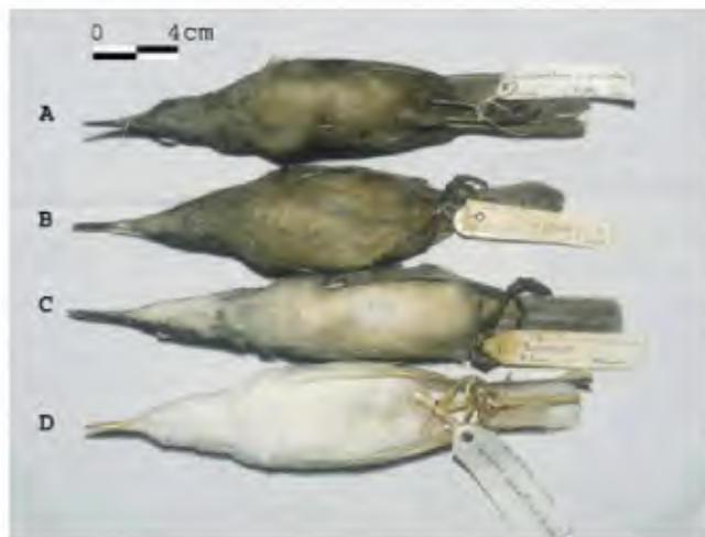
Figure 3. Specimens in ventral view: A, Cincloerthia tremula pavida BMNH 1840.5.13.11 (Nevis); B, C. ruficauda tenebrosa BMNH 1898.2.8.21 (St Vincent); C, C. c. macrorhyncha BMNH 1894.12.24.2 (St Lucia); D, holotype of Necropsar leguati LIV D.1792.