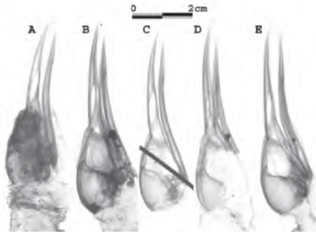
Figure 2. X-radiographs of the skulls in skin specimens in lateral view. A, holotype of Necropsar leguati LIV D.1792; B, Cincloerthia gutturalis BMNH 1856.3.12.10 (Martinique); C, Cincloerthia tremula pavida BMNH 1840.5.13.11 (Nevis); D, Cincloerthia macrorhyncha BMNH 1894.12.24.2 (St Lucia); E, Cincloerthia ruficauda tenebrosa BMNH 1898.2.8.21 (St Vincent). Note not only the great similarity of N. leguati and Cincloerthia , but also the absence of the ossified posterior border of the nostril that characterises the Pycnonotidae, with which N. leguati was first associated.