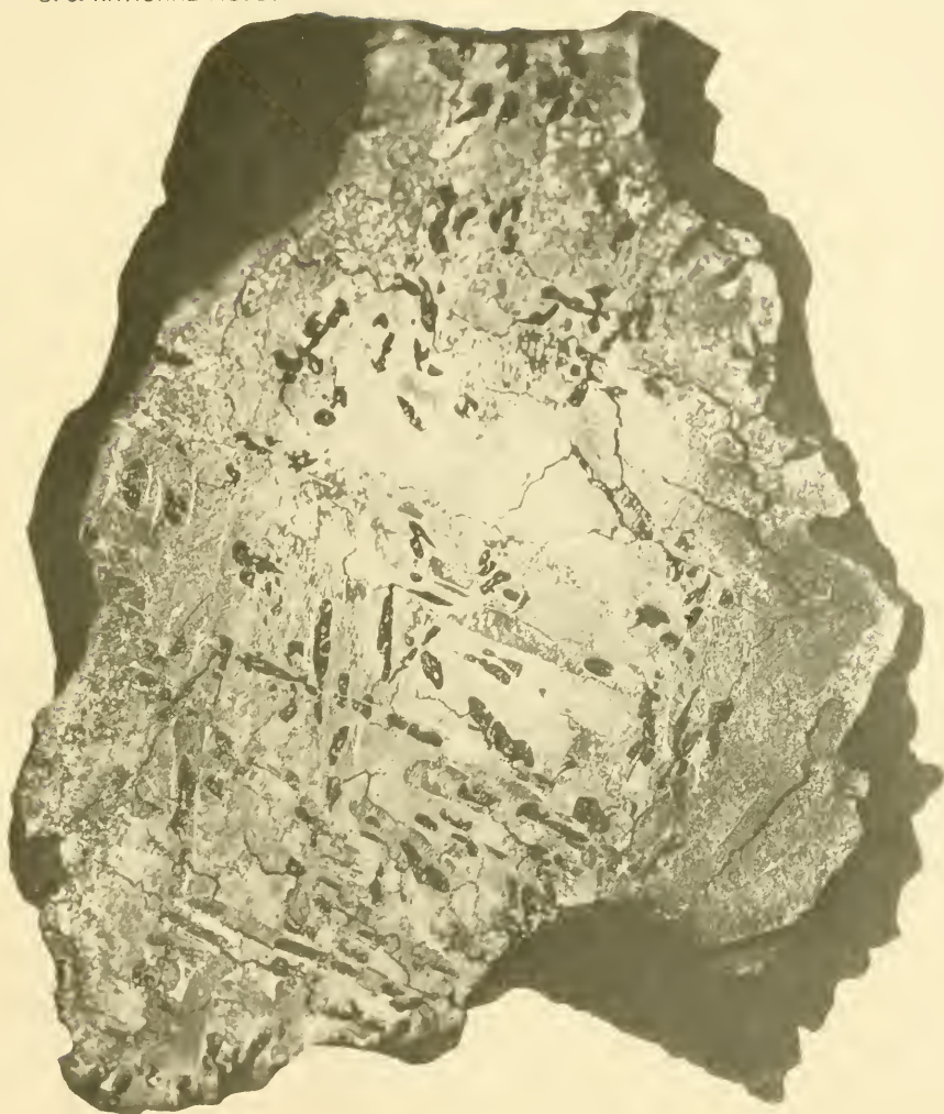
POLISHED AND ETCHED SURFACE OF THE DUNGANNON (VA.) METEORIC IRON. Enlarged about 2 diameters.