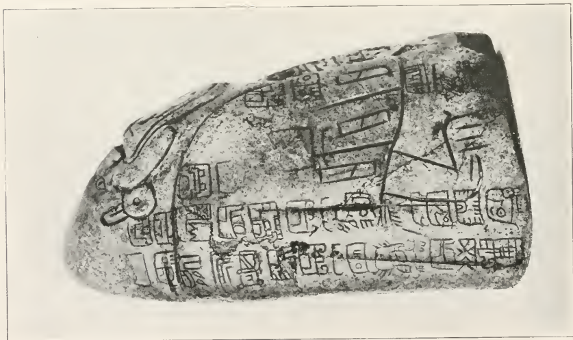
TUXTLA STATUETTE. (RIGHT AND LEFT SIDE VIEWS.)