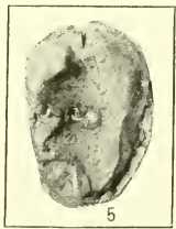
METAXYTHERIUM FLORIDANUM, NEW SPECIES.