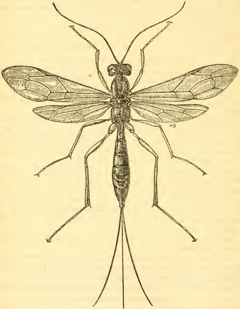
FIG. 2.— COLEOCENTRUS OCCIDENTALIS CRESSON. ADULT FEMALE ENLARGED ABOUT 3 DIAMETERS.

The male differs from the female principally in color, the red of the abdomen being confined largely to the sutures and the sides of