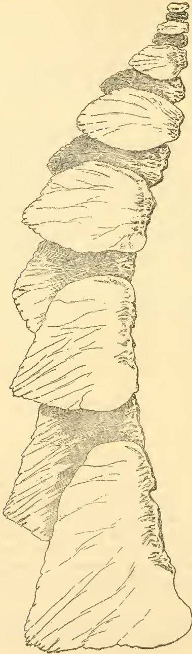
FIG. 1.—DERMAL PLATES OF STEGOSAURUS STENOPS MARSH. TYPE, NO. 4934 U. S. NATIONAL MUSEUM. ABOUT \frac{1}{4} NATURAL SIZE. THE FIRST PLATE NEAREST THE HEAD IS MISSING.