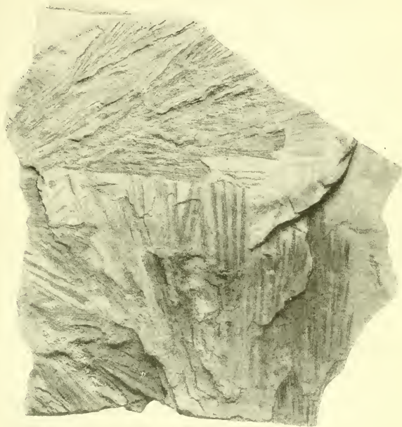
BRUNSWICKIA DUBIA, NEW SPECIES.