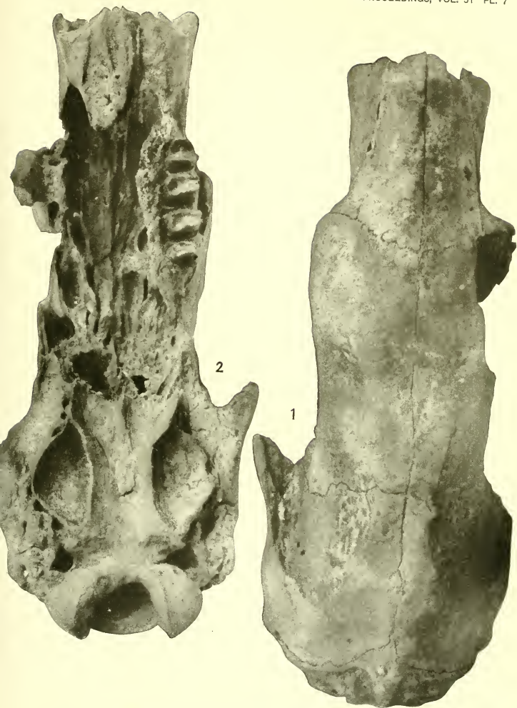
SKULL OF NOTHROTHERIUM TEXANUM (1) FROM ABOVE, (2) FROM BELOW.