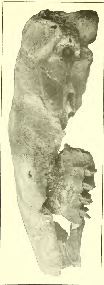
SKULL OF NOTHROTHERIUM TEXANUM FROM LEFT SIDE.