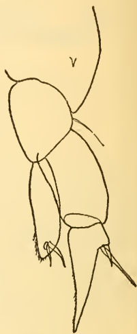
FIG. 4.— DIAPTOMUS VIRGINIENSIS . FIFTH FOOT OF FEMALE, \times 875 .

The first basal segments of the female fifth feet (fig. 4) are armed with rather small spines. The lateral hairs of the second basal segments are rather long and slender. The exopodite consists of two segments. The hook of the second