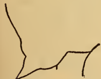
FIG. 1.—DIAPTOMUS VIRGINIENSIS. LATERAL WING LAST CEPHALOTHORACIC SEGMENT, \times 445 .

Of moderate size. The first cephalothoracic segment is somewhat longer than the three following. The third and fourth are much shorter than the second. The last cephalothoracic segment is somewhat produced laterally, and terminates on each side in a rather acute point. About midway on the posterior border of each lateral lobe is a minute spine (fig. 1). The general form of the cephalothorax is slender, the anterior part narrow and almost pointed.