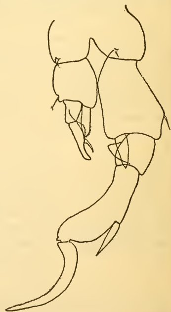
FIG. 5.— DIAPTOMUS VIRGINIENSIS . FIFTH FOOT OF MALE, \times 445 .

The spines of the first basal segments of the male fifth (fig. 5) feet are of moderate size. The second basal segment of the right foot is rather elongate, its distal end twice as wide as its proximal. The inner margin is convex, the outer straight, making a rather sharp bend near its distal end. The lateral hair is situated at about three-fourths its length. The first segment of the exop-odite is about as broad as long, its in-ner and outer margins convex, and bears a triangular hyaline projection on its inner margin, which is continued as a shelflike projection on its posterior sur-face. The second segment is approx-imately four times as long as broad, con-cave on the inner margin and convex on the outer. The lateral spine is stout, about one-third the length of the seg-ment, and situated about midway of its