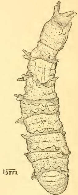
FIG. 3.— CERATODRILUS THYSANOSOMUS . DORSAL VIEW.

Bdellodrilus pulcherrimus from Cambarus bartonii (Watauga County, North Carolina); "crayfish" (Lake Clear, New York).