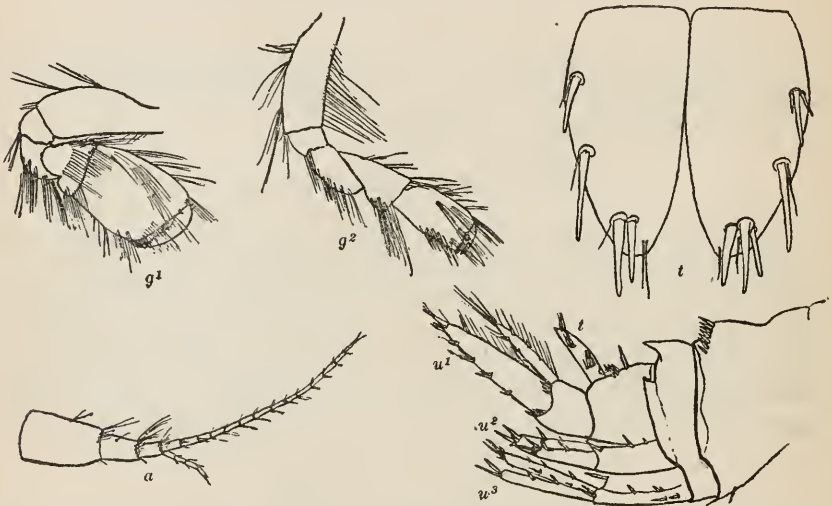
FIG. 1.—GAMMARUS PRIBILOFENSIS. a, FIRST ANTENNA; g^1 , FIRST GNATHOPOD; g^2 , SECOND GNATHOPOD; t, TELSON; u^1 , u^2 , u^3 , UROPODS.