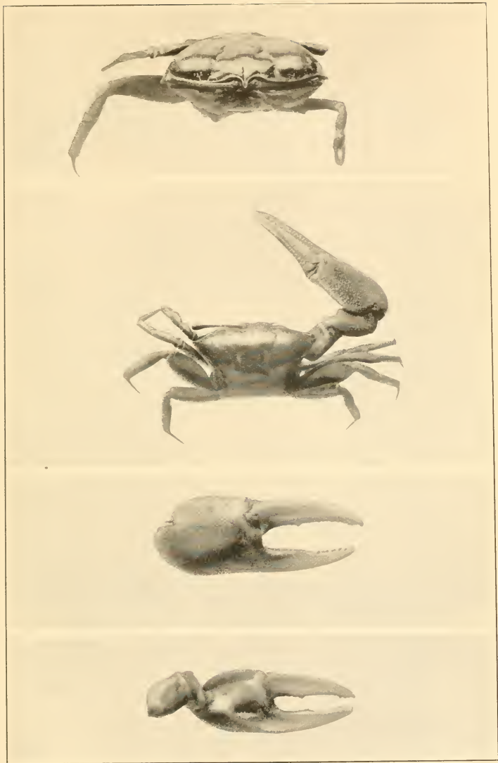
NEW CRABS OF FAMILY OCYPODIDÆ.