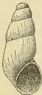
FIG. 2.—NODULUS ASSER.

Shell elongate-conic, bluish white, semitranslucent. Nuclear whorls one and one-tenth, smooth, a little less elevated than the succeeding turns. Post-nuclear whorls very high between the sutures, overhanging, moderately rounded, appressed at the summit. The preceding whorl shines through the summit of the succeeding turn and gives this the appearance of having a double suture. Sutures well impressed. Periphery of the last whorl well rounded. Base moderately prolonged, well rounded. Entire surface of spire and base marked by closely placed, exceedingly fine, microscopic, spiral striations. Aperture very broadly ovate; posterior angle obtuse; outer lip thin; peritreme complete.