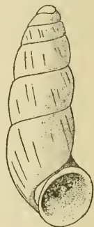
FIG. 3.—NODULUS KELSEYI.

Shell small, very slender, cylindro-conic, translucent, white. Nuclear whorls two, strongly rounded, smooth. Post-nuclear whorls rather high between the sutures, well rounded, very narrowly shouldered at the summit and lightly constricted a little anterior to the summit, marked by fine lines of growth and exceedingly fine, spiral striations. Suture moderately constricted. Periphery of the last whorl and the long